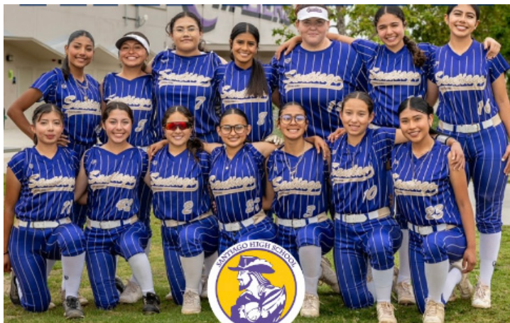
SANTIAGO HIGH SCHOOL won the Garden Grove League softball title, winning all 10 of its league games.

Santiago (10-0, 13-6) is first and Los Amigos (8-2, 14-6)