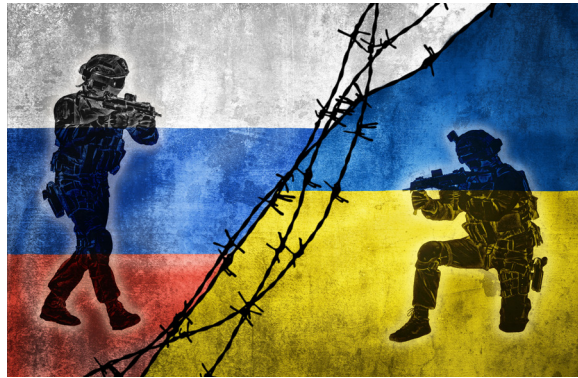
UKRAINE to be getting more US aid.

On Thursday, the Russian defense minister