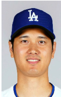
SHOHEI OHTANI.

Ohtani hit his 176th home run on Sunday, surpassing Hideki Matsui for the most in Major League Base-