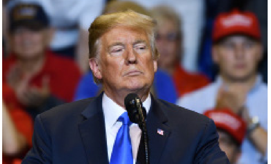
LAWYERS for Donald Trump worked to try to discredit the first prosecution witness on Friday in the "hush money" trial.

Under cross-examination, Pecker conceded that he never used the term "catch and bury" in a meeting with Trump and that money terms were not discussed. The trial will resume Tuesday.