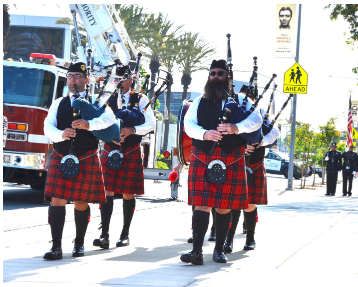
BAGPIPES are traditional at the Garden Grove Police Memorial. The 2024 observance is scheduled for May 16.