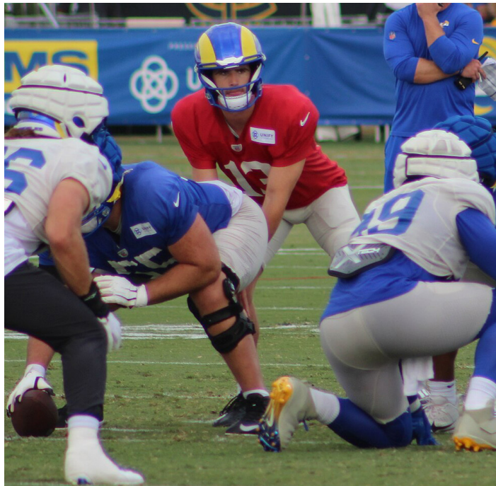
STETSON BENNETT in Rams' training camp.