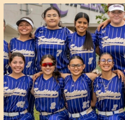
SPORTS PAGES Page 8