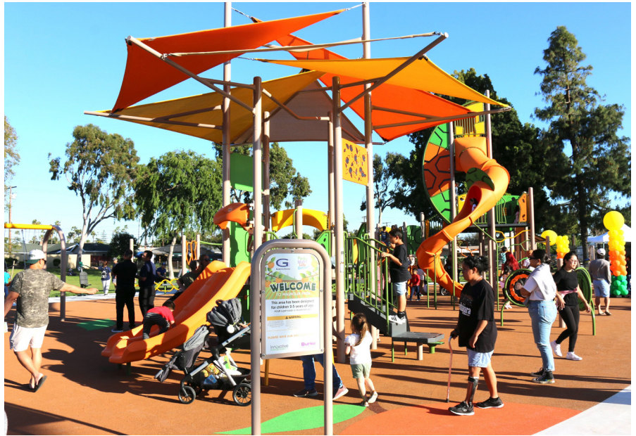
THE RECENTLY remodeled Magnolia Park (Magnolia Street and Orange-wood Avenue) in Garden Grove has an orange grove theme in observance of the land being used by the Wakeham family as both a home and a citrus grove from the 1920s into the 1960s.