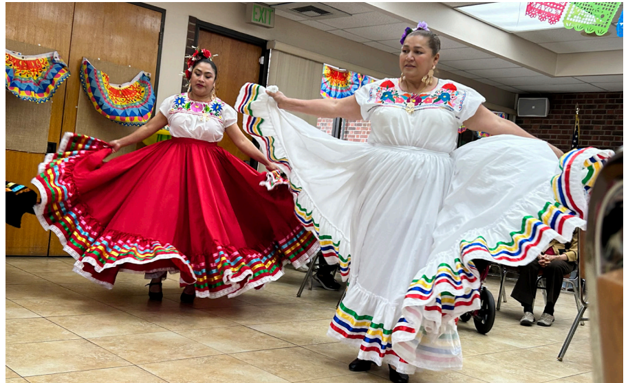
FOLKLORICO dancers provided the entertainment at the Westminster Senior Citizen Center on Friday in observance of Cinco de Mayo, the Mexican holiday celebrating the defeat of invading French forces in 1862 (Tribune photo).