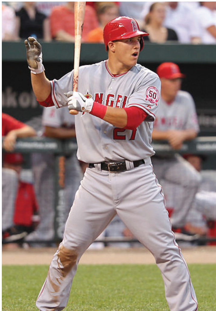
MIKE TROUT is hurt ... again