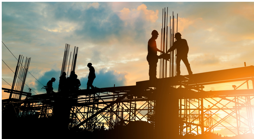
175,000 NEW JOBS is below predictions (Wikipedia).