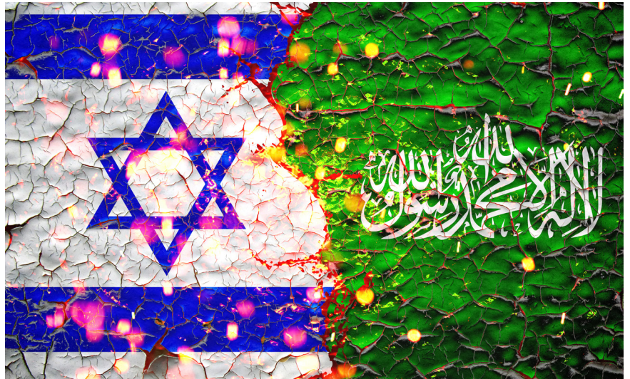
NEGOTIATIONS are being led by Egypt and the United States.

Earlier, Israeli Prime Minister Benjamin Netanyahu stated that his nation's goal was to completely destroy Hamas.