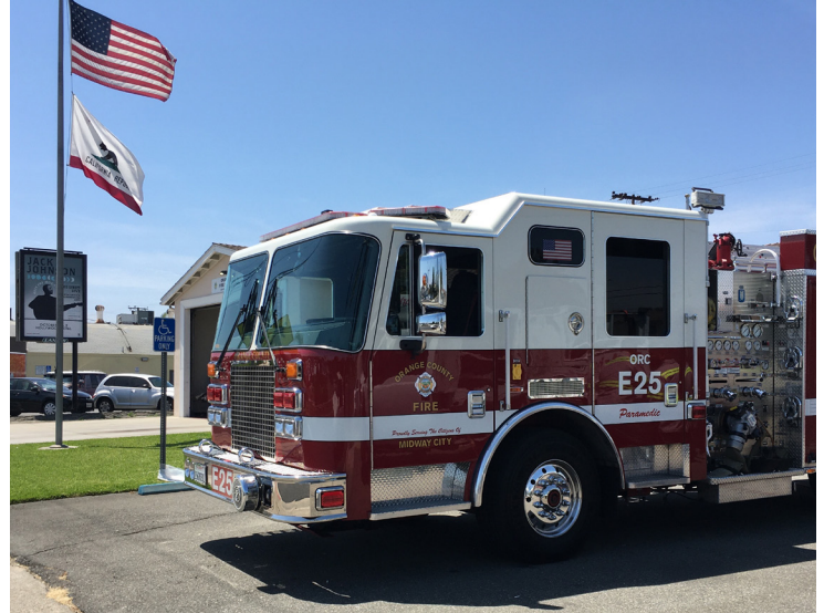
THE ORANGE COUNTY Fire Authority has a small station in Midway City on Bolsa Avenue.

According to the report, a "resolution of intent" to annex the