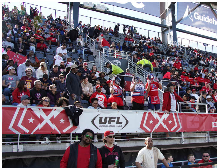
UFL ATTENDANCE and TV numbers are encouraging so far in the combined league's first season.