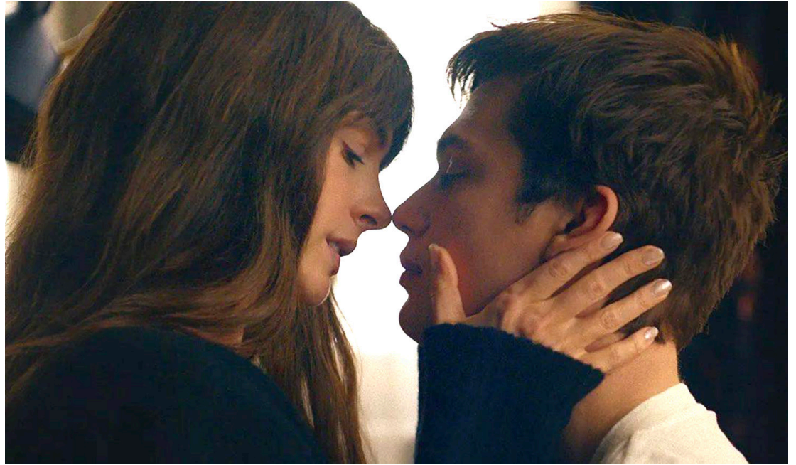
NICHOLAS GALITZINE and Anne Hathaway star in "The Idea of You"(Amazon/MGM).

"The Idea of You," which debuts Thursday on Prime Video, is full of all the kinds of contradictions that can make a rom-com work. The highly glamorous, megawatt-smiling Hathaway is playing a down-to-earth nobody. The showbiz veteran in the movie is played by Galitzine, a less well-known but up-and-coming British actor whose performance in the movie is quite authentic. And even though the whole scenario is undeniably a glossy high-concept Hollywood fairy