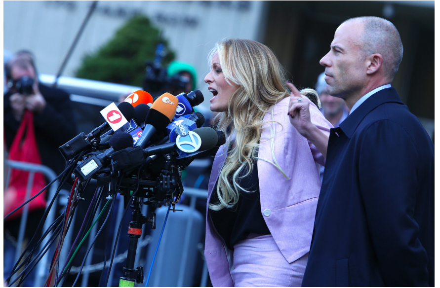
STORMY DANIELS outside a court room in 2018.

Trump’s lawyers sought a mistrial, which the judge denied.