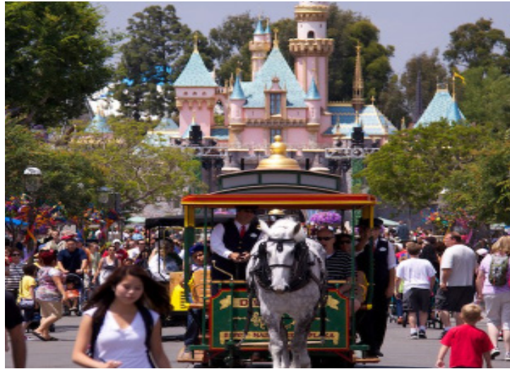
MICROSOFT'S BING SEARCH engine places Disneyland in Garden Grove instead of Anaheim (File photo).