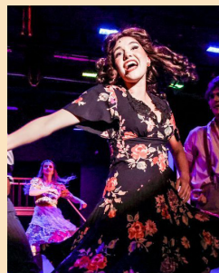
ARTS & LIVING 5