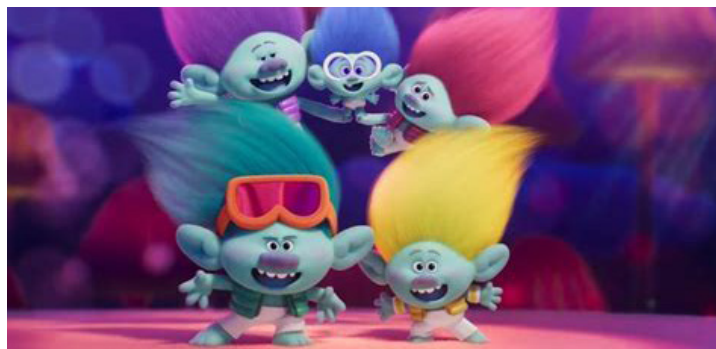
“TROLLS: BAND TOGETHER” will start the movie series.

The Sunken Gardens are located at 8200 Westminster Blvd, east of Beach Boulevard. Call the City of Westminster's Community Services & Recreation Department at (714) 895-2860.