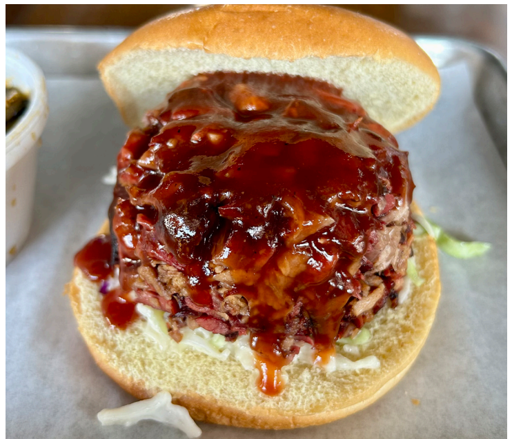
PULLED CHICKEN SANDWICH at Beale's Texas BBQ.

The phone number is (562) 588-3070 and they're on the Web at www.bealestexasbbq.com .