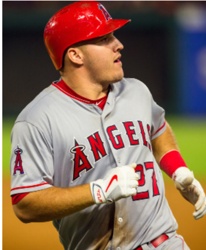
MIKE TROUT is finding that recovery from his knee injury is taking longer than expected, despite a complete rehabilitation regimen

Still not running weeks after a right knee injury