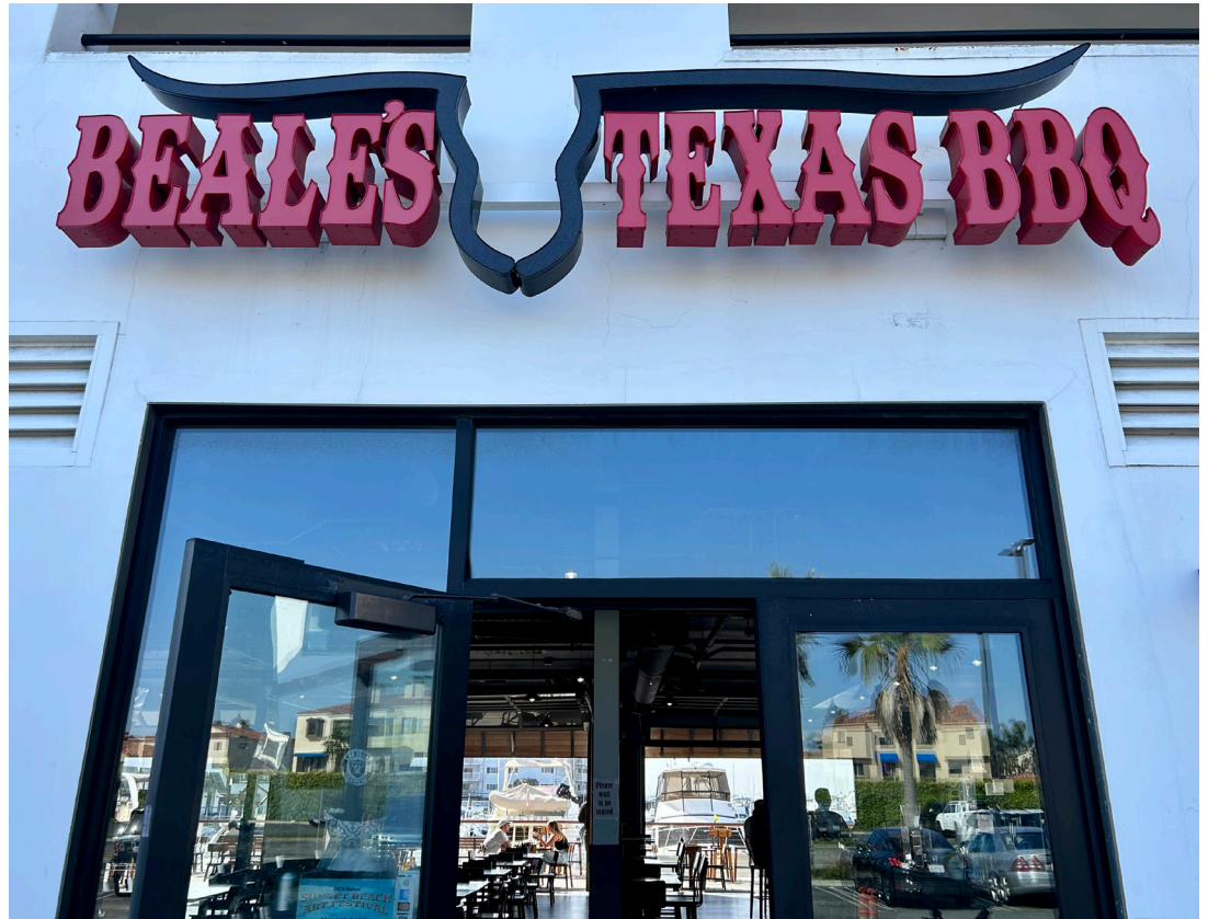
BEALE'S TEXAS BBQ at Peter's Landing in Huntington Beach (Tribune photos).

I have sampled several of the dishes during my visits, but my favorite, hands down, is the pulled chicken sandwich. The chicken is tender and juicy with just the right amount of BBQ sauce added to give it a little zing. It's piled high and sits atop just the right amount of tangy cole slaw—not the mayonnaise-laden variety, thank goodness. It's all nestled in a buttery bun and is far less messy than one