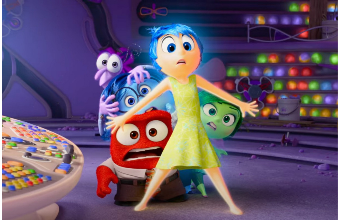
'INSIDE OUT takes on the touchy subject of the onset of puberty (A Walt Disney Co. release).

Tempting as it is to take any revisiting of "Inside Out" — a high water mark for not just Pixar but '10s American movies — as sacrilegious, its sequel is deftly sensitive to one of the most awkward chapters of life. The giddy sense of imagination is a little