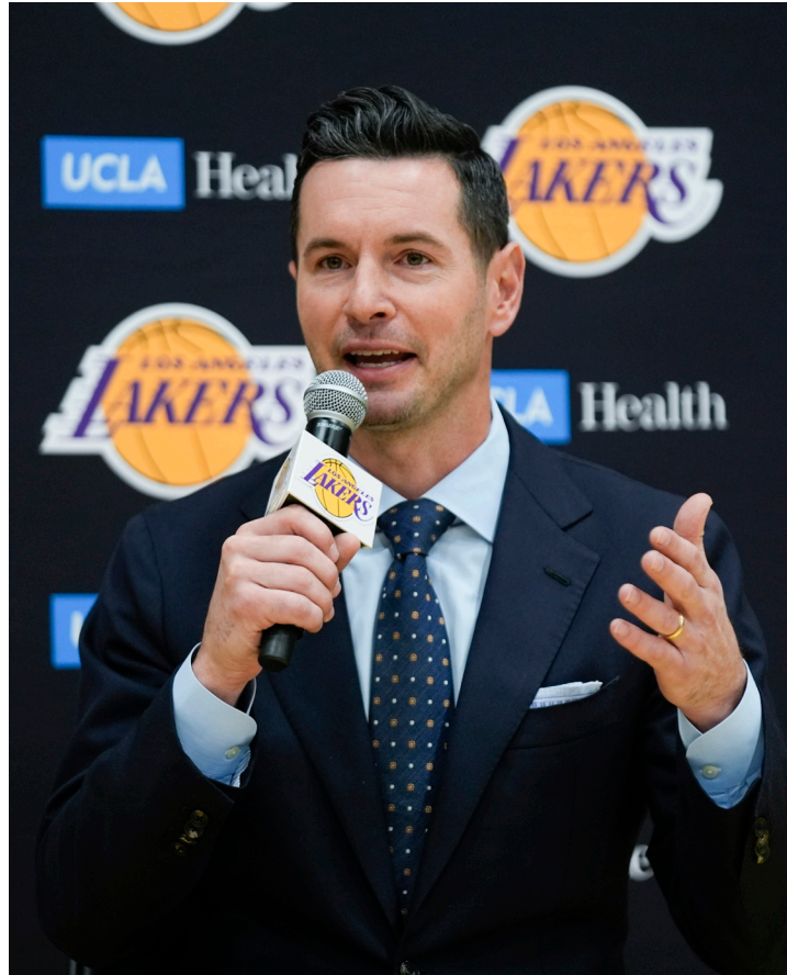
J.J. REDICK speaks after being introduced as the new head coach of the Los Angeles Lakers NBA basketball team Monday, June 24, 2024, in El Segundo.

Redick expected to bring new ideas to team