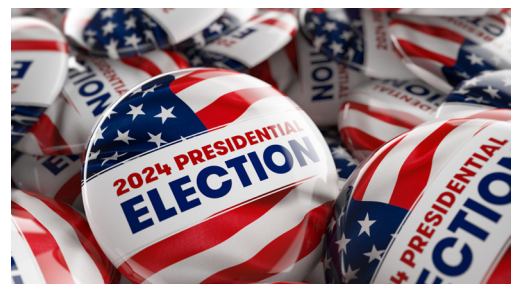
BIDEN AND TRUMP CLOSE.

Biden’s support is 40.9 percent to 40.7 percent for former president Donald Trump. The margin of 0.2 percent isn’t much, but its significance may come from it’s the first time the Democrat has held any lead since mid-April.