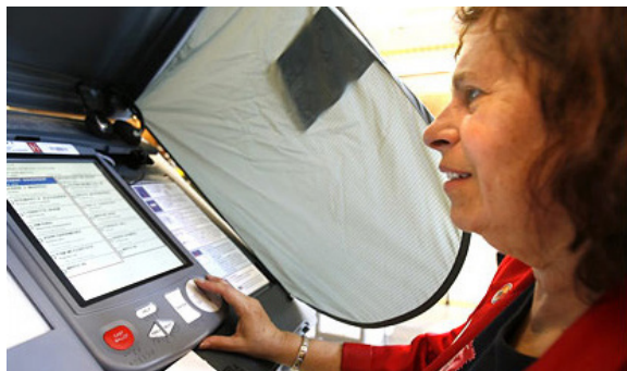
PRIMARY VOTING in New York, Utah, Colorado.