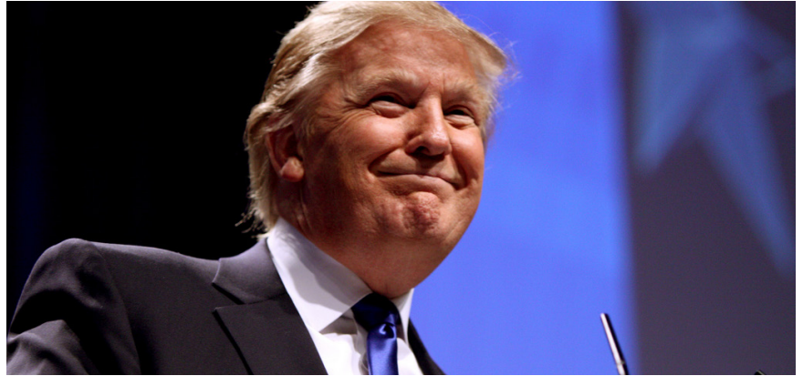
FORMER PRESIDENT Donald Trump.

Trump’s campaign criticized the ruling, saying it was “unlawful” and has promised to challenge it in court.