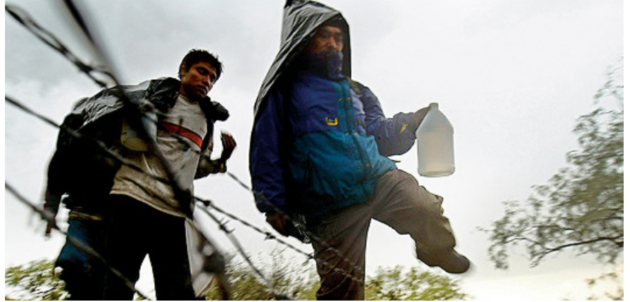
BORDER SECURITY continues to be an issue.

The restrictions would be lifted two weeks after encounter numbers hit and or declined below 1,500 per day, based on a seven-day average.