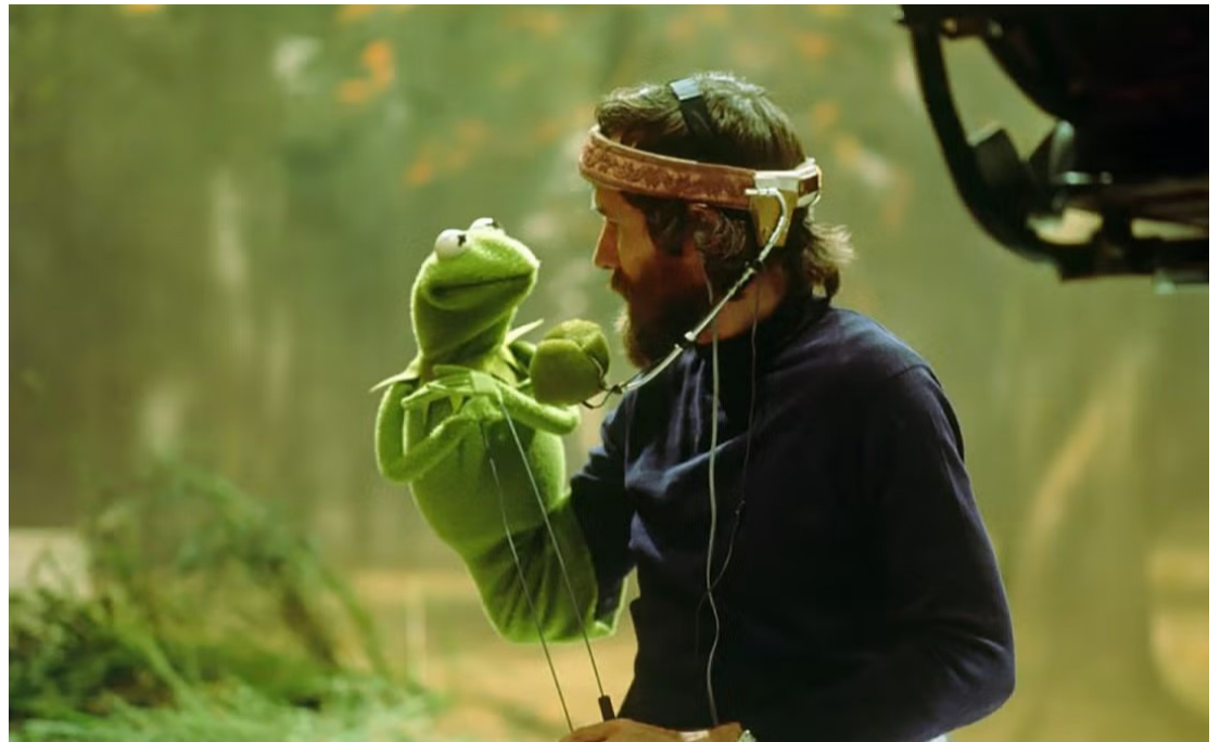
JIM HENSON really got into his characters, as shown in “Jim Henson Idea Man” (Disney+).

It’s also a portrait of a driven, brilliant creative man who wanted to be taken seriously as an