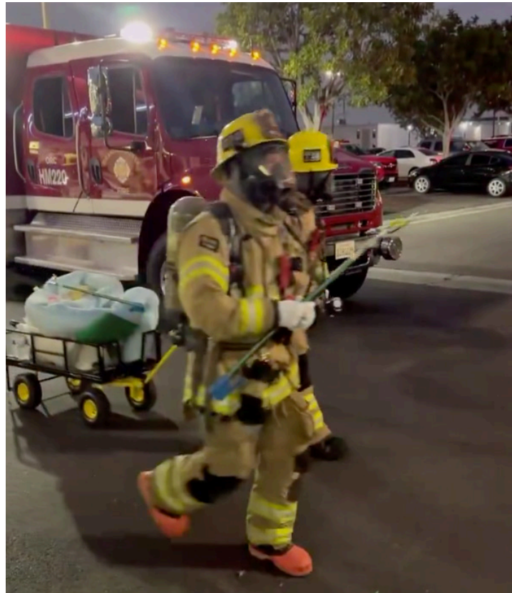
HAZMAT INCIDENT at Hoover Street and Garden Grove Boulevard (OCFA photo).