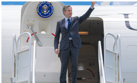
SECRETARY of State Antony Blinken.