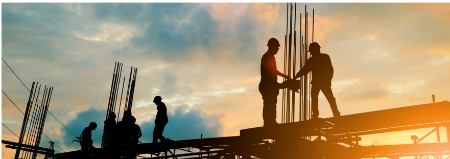
NON-FARMING employment rose by 272,000 jobs in May.

The federal Bureau of Labor Statistics – part of the Department of Labor – announced Friday that non-farm employment increased by 272,000 jobs in May.