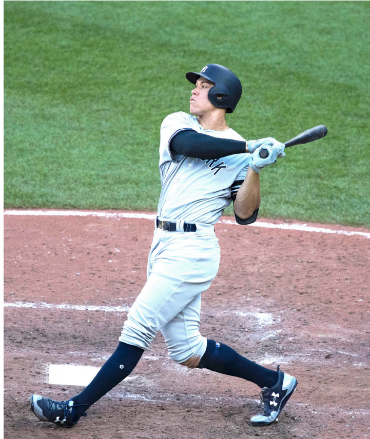
AARON JUDGE was 2-for-3, drove in one run and walked twice but the New York Yankees lost to the Los Angeles Dodgers 2-1 in 11 innings on Friday night