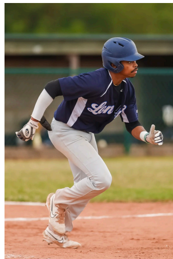
THE LONDON METS are the top Great Britain team.