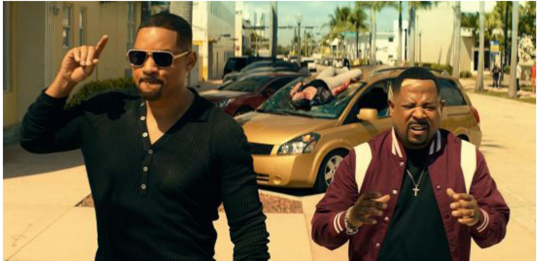
WILL SMITH AND MARTIN LAWRENCE are back in “Bad Boys: Ride or Die”

Some signs of age is creeping in “Ride or Die.” Marcus has a heart attack on the dance floor