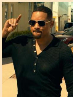
ARTS & LIVING 5