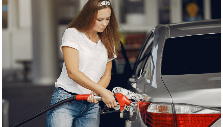
AUTOMOBILE MILEAGE required to hit 65 miles per gallon by 2031.

Currently, EVs represent 7.6 percent of sales.