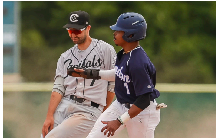
THE LONDON CAPITALS are the chief rival of the Mets.

York Yankees, and the Capitals are, well, the Mets.