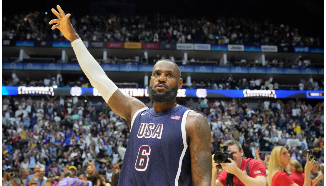
UNITED STATES' forward LeBron James waves to the crowd after the end of an exhibition basketball game between the United States and South Sudan, at the o2 Arena in London, Saturday, July 20, 2024.