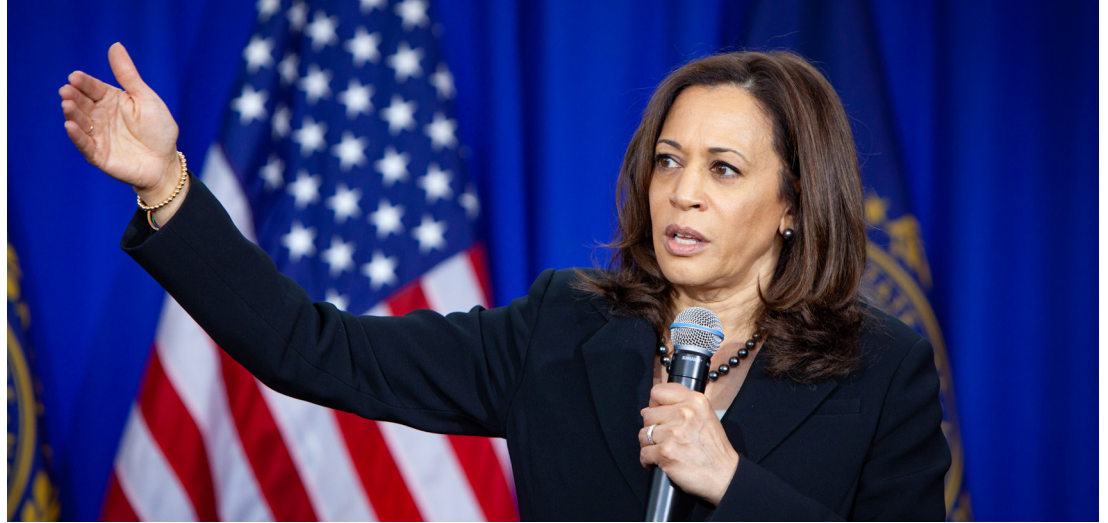
VICE PRESIDENT KAMALA HARRIS

She has recently rounded up enough delegate support to be officially named the Democratic