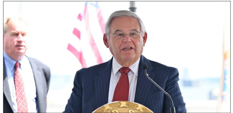
SEN. ROBERT MENENDEZ.

Menendez was found guilty of 16 federal crimes on July 16 as part of a bribery operation that