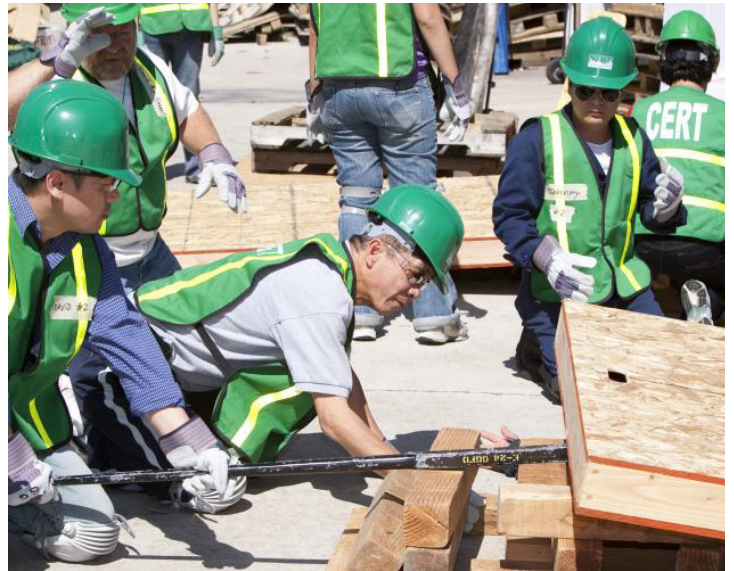
CERT teaches light search and rescue (City of Garden Grove)

For more, visit www.ggcity.org/cert or call (714) 741-5994.