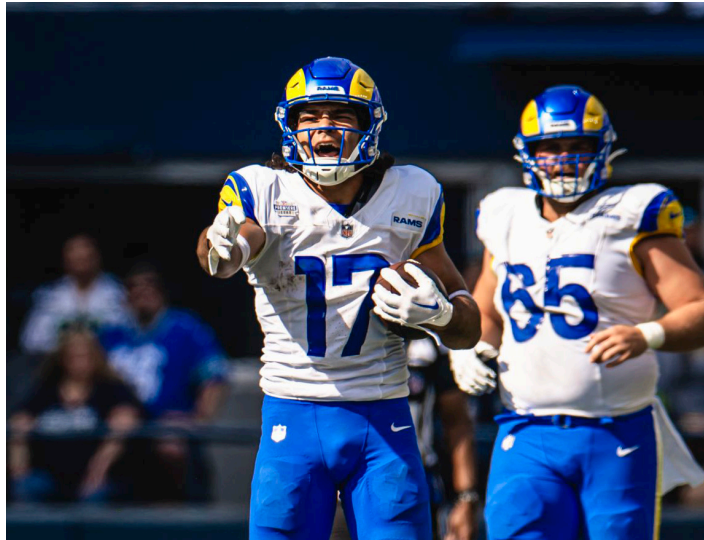
PUKA also has a pretty good sense of humor.

Nacua's biggest goal during training camp is to cut down on dropped passes. He had six