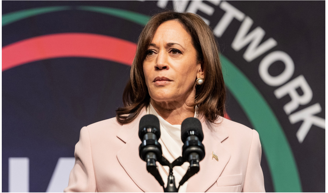
KAMALA HARRIS will have no opposition in the delegate voting.

In other political news, at a rally in Georgia, Harris taunted Republican nominee Donald Trump about whether he would participate in the next scheduled debate. Referring to Trump's