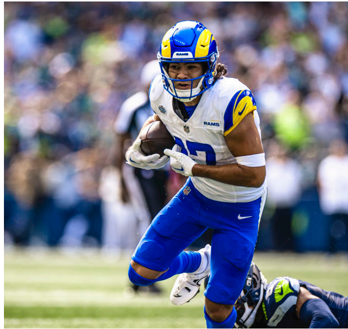
PUKA NACUA had a spectacular rookie season for the Rams in 2023 and hopes to repeat that.