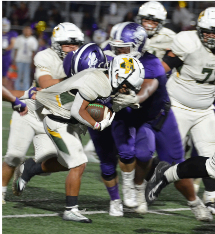
RANCHO ALAMITOS (in white uniforms) has won (or tied for) six consecutive Garden Grove League football championships and this fall it will move into the new “Sigma League” as part of the “competitive equity” policy of the CIF-SS