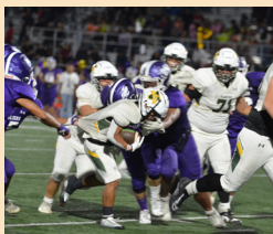
SPORTS PAGES 6-7