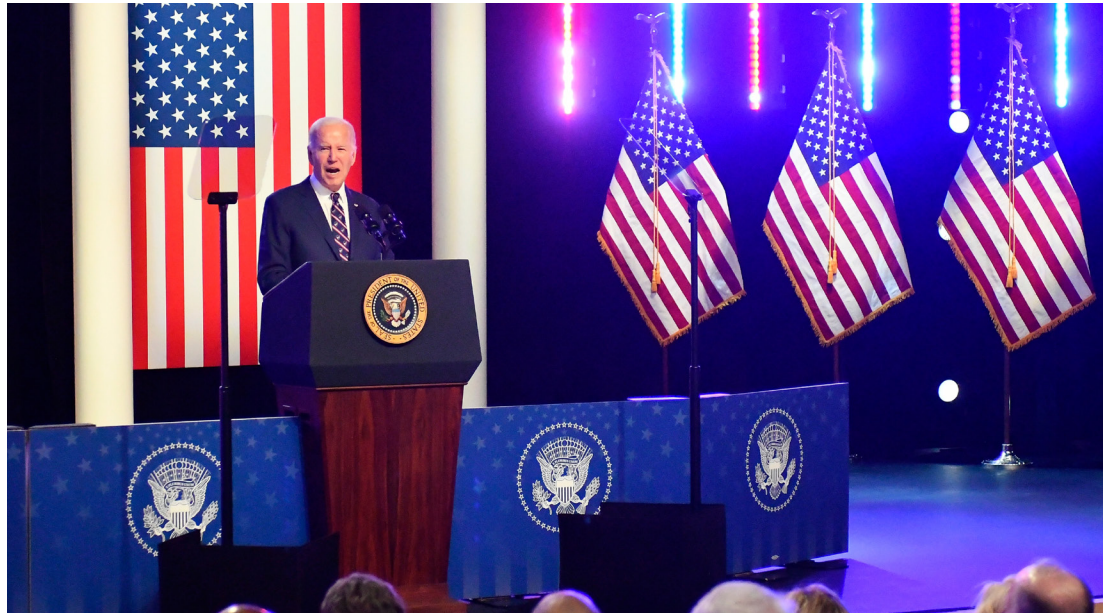
PRESIDENT JOE BIDEN.

House Democratic Leader Hakeem Jeffries revealed that he had met with Biden and discussed with him the concerns of fellow members of their party over the prospects for Nov. 5.