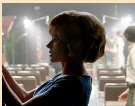
ARTS & LIVING 5

Scarlett J. gives “Fly Me to The Moon” a lift