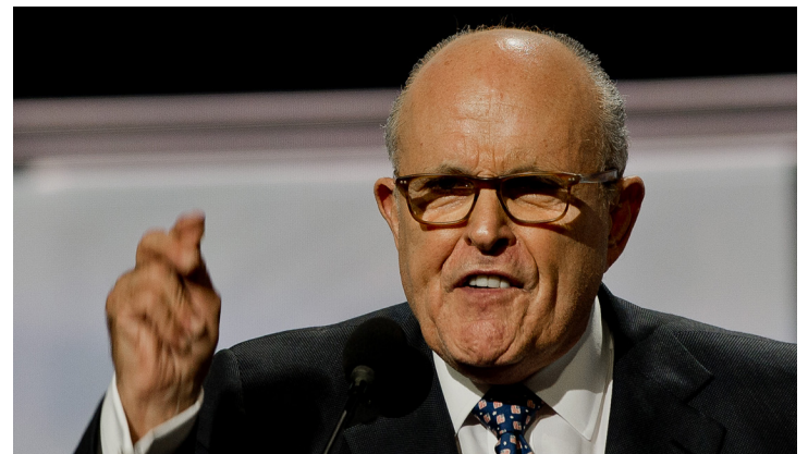
RUDY GIULIANI.

In addition to dismissing the case, Sommer prohibited its filing again.