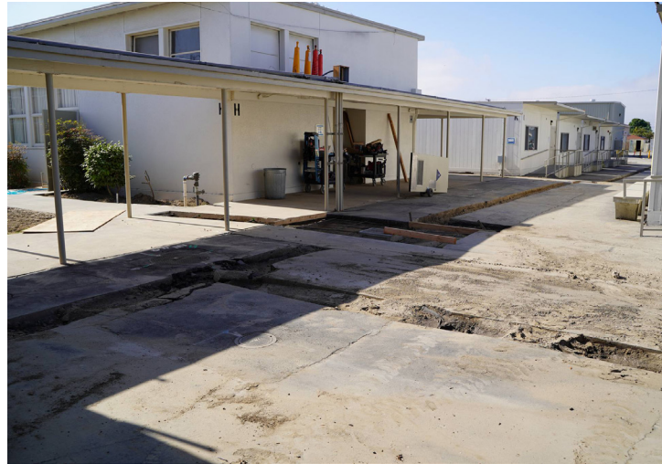
LINCOLN EDUCATION CENTER traces its history back to the opening of Lincoln Elementary School in 1910 in Garden Grove. It’s now undergoing renovations.