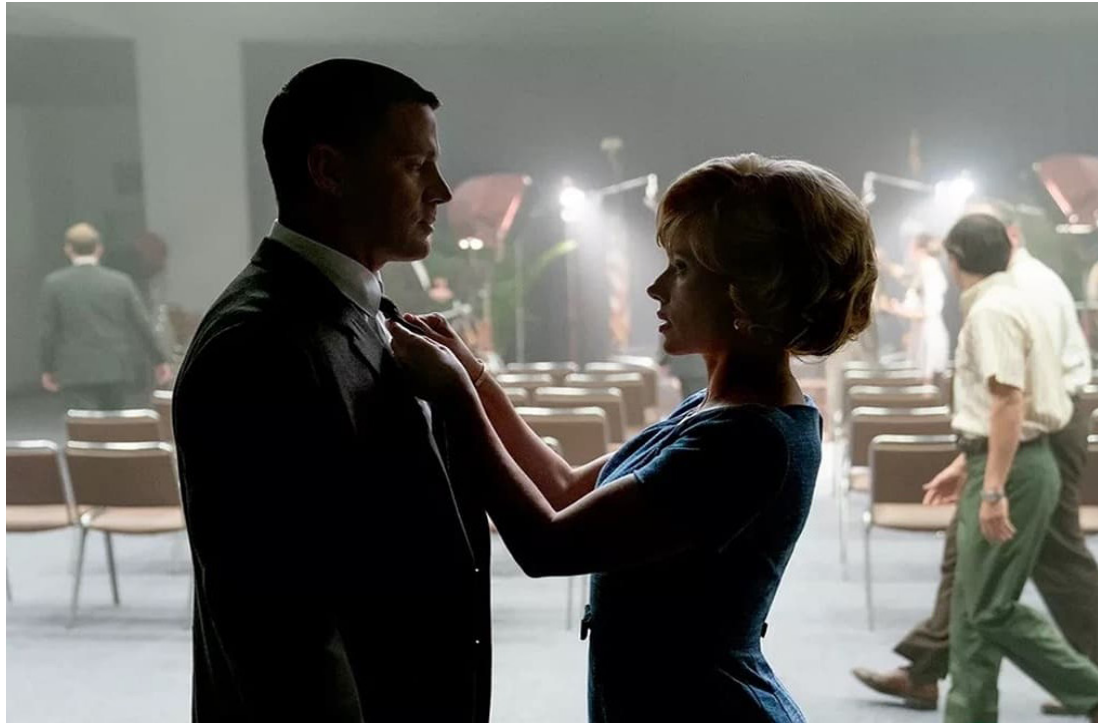
SCARLETT JOHANSSON and Channing Tatum star in “Fly Me To the Moon”