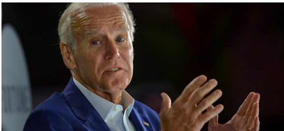
PRESIDENT JOE BIDEN.

Seeking to “turn the page” after his shaky debate performance against Donald Trump last week, President Joe Biden plans to hold a press conference, meet with Democratic party leaders and conduct a televised interview within the next few days.