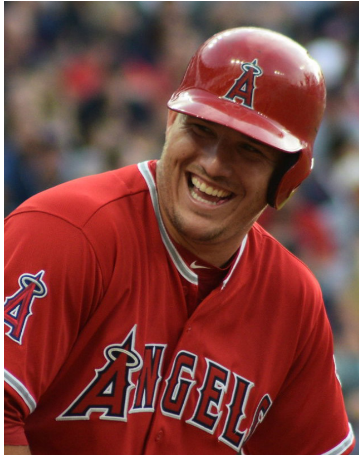
MIKE TROUT feels he is making enough progress that he expects to be back in the lineup by late July.

That's his hope, and those of Angels' backers