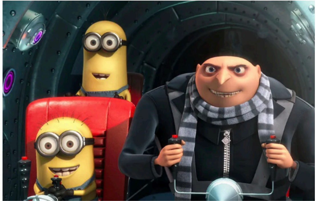
“DESPICABLE ME 4” has some familiar goofy comforts (Universal Pictures).

That’s not all bad. Much of what makes the “Despicable Me” movies fun is that they avoid any sense of seriousness like the plague. They stand proudly in the Looney Tunes realm of animation, with little aim beyond loosely stitching slapstick sequences together. There’s a good chance you might cry during a Pixar movie, but if