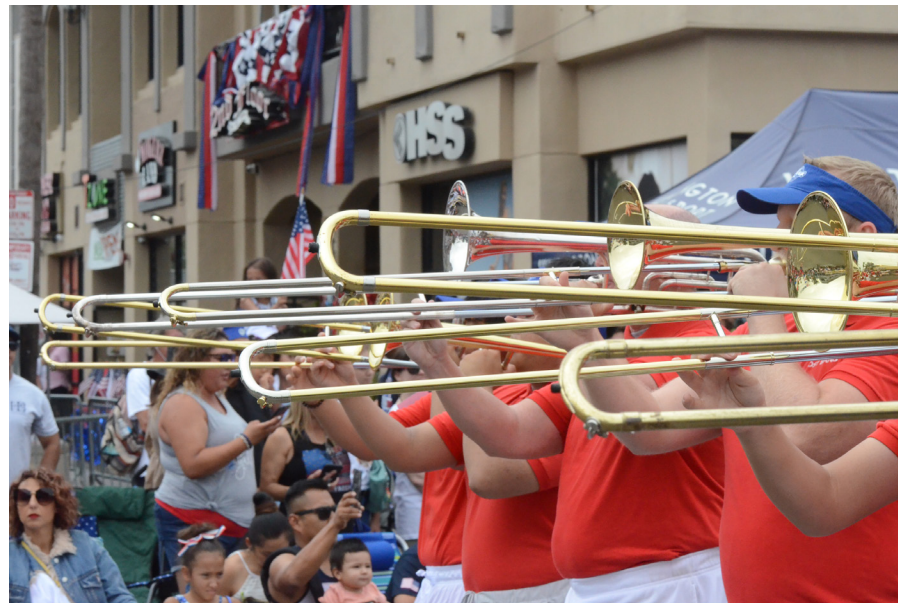
TROMBONES won't be the only music or entertainment in the 120th Huntington Beach 4th of July parade on Thursday.