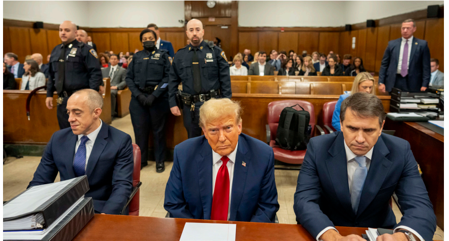
DID THE ‘IMMUNITY’ ruling affect the “hush money” trial?.

paying money to a former porn star to remain silent on their relationship in order to protect his political future, was originally set for July 11. But Trump and his defense team arguing that the high court ruling – which gives the president “absolute” immunity in his capacity as chief executive, but none for private acts – exonerates him.