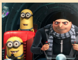
ARTS & LIVING 5

Minion mayhem returns with ‘Despicable 4’