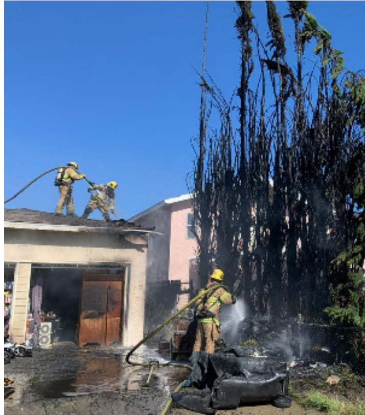
TREE FIRE on Barber Street in Westminster Sunday was quickly extinguished by Orange County Fire Authority crews (OCFA photo).