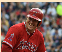
SPORTS PAGES 6-7

Minion mayhem returns with ‘Despicable 4’