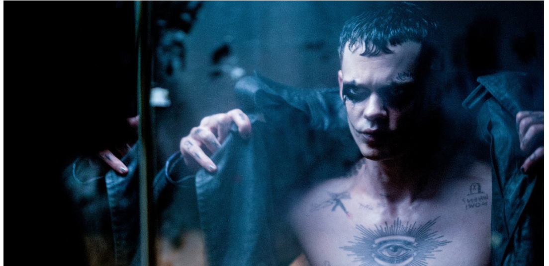
BILL SKARSGÅRD stars in "The Crow" (Lionsgate.)

Bill Skarsgård seizes Lee's role of Eric Draven, a man so in love that he returns from the dead to revenge his and his sweetheart's slayings in what can be best called a sort of supernatural, romantic murderfest. (The tagline, "True