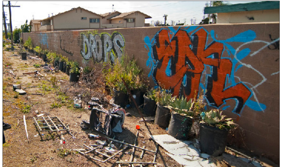
GARDEN GROVE will be getting more resources to battle graffiti on a more timely fashion after action Tuesday night by the city council.