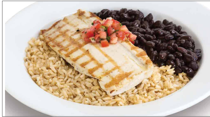
A WAHOO BOWL