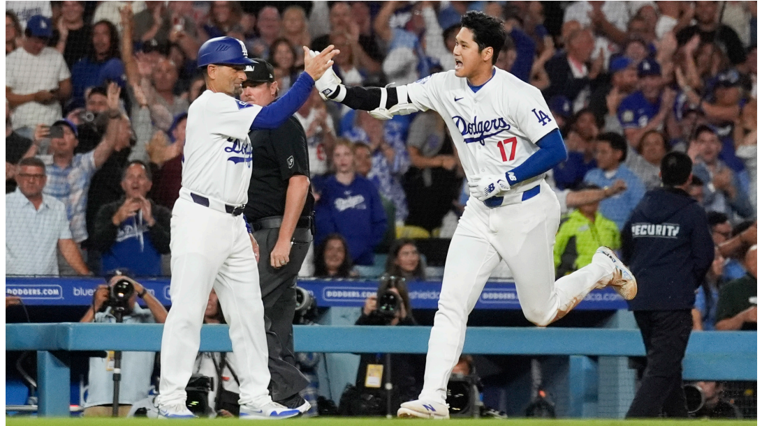
SHOHEI OHTANI rounds third after hitting his walkoff grand slam Friday.