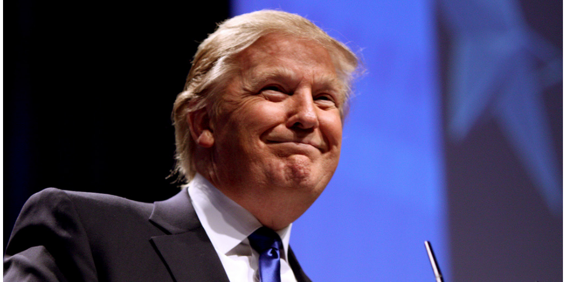
FORMER PRESIDENT Donald Trump (File photo)

Under the new criminal case, the original allegations that Trump sought – in his official capacity – to replace Justice Department officials with others to comply with this actions have