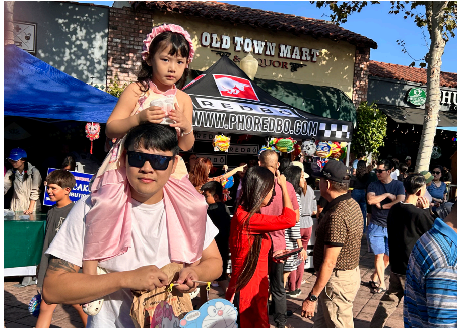
The second Mooncake Festival came to Garden Grove's historic Main Street on Saturday and throngs filled a one-block stretch of that street with many traditional Vietnamese activities including the sharing of "mooncakes" and the painting of lanterns. The event was sponsored by the Vietnamese Soccer Association of Orange County.