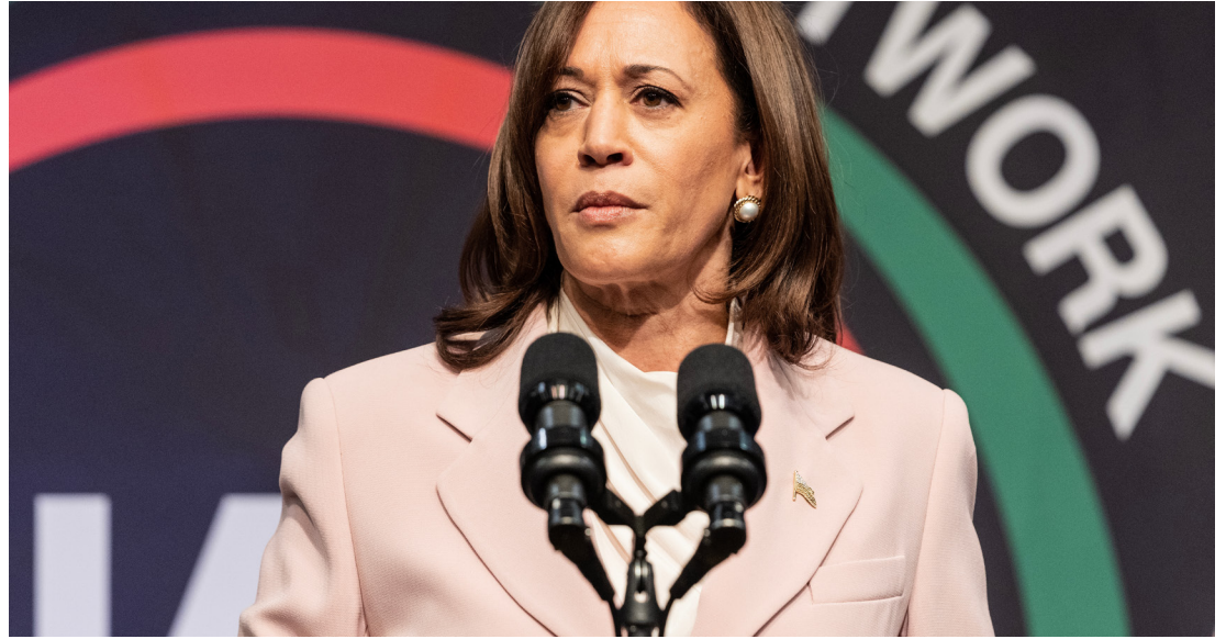
VICE PRESIDENT KAMALA HARRIS.

In the wake of that, there have been bomb and other violent threats in that city, which have closed schools and other public