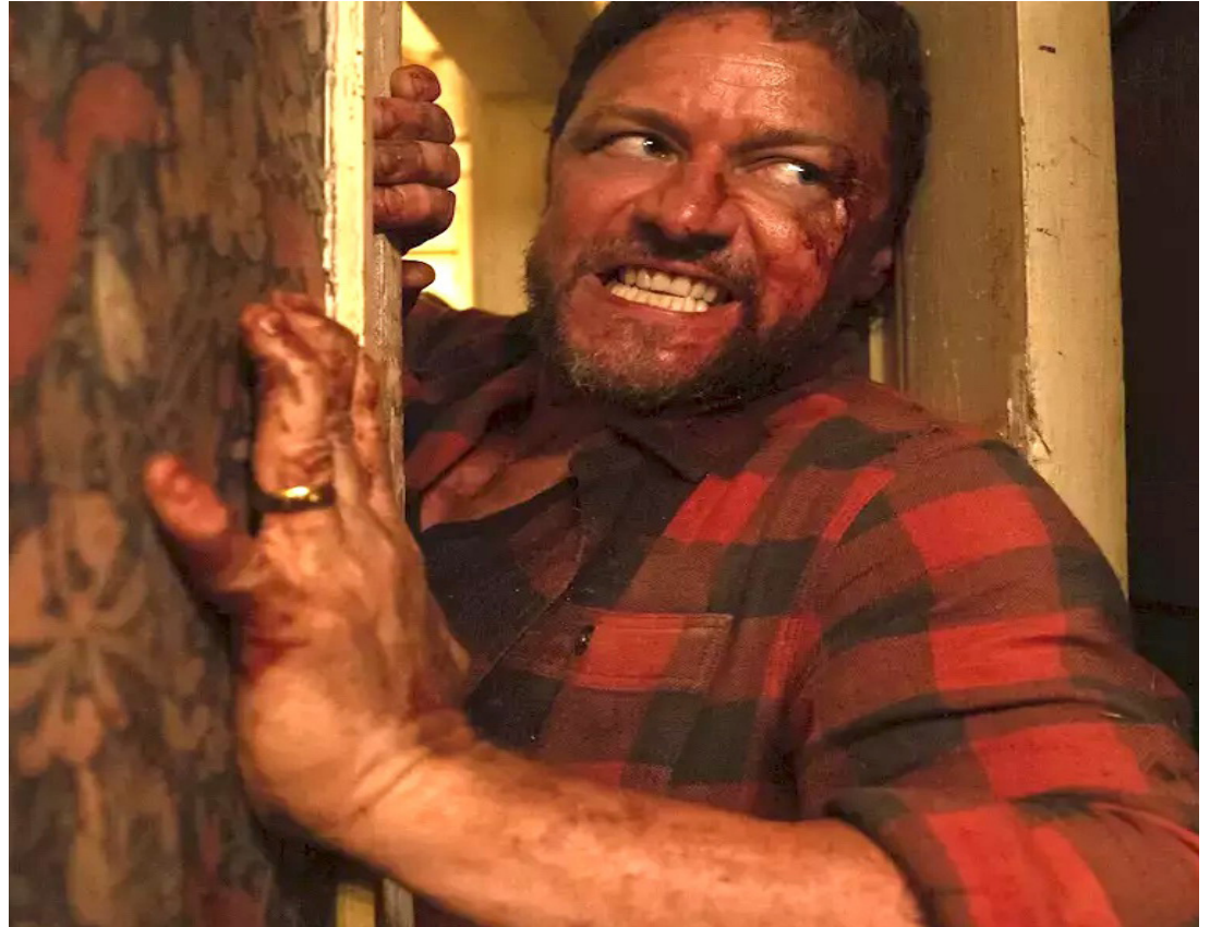
JAMES McAVOY stars in "Speak No Evil" (Universal Pictures/Blumhouse).

But for a while, it's a way more intelligent film. And the jumpy moments work — I'll confess to literally springing out of my seat when someone uneventfully