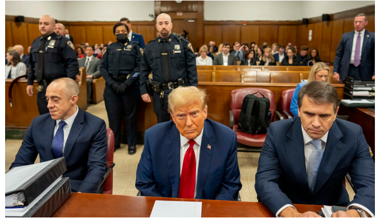
DONALD TRUMP will be sentenced on Nov. 26.

However, Trump was convicted based on events in 2016, in which he was convicted of paying $130,000 to a porn star in