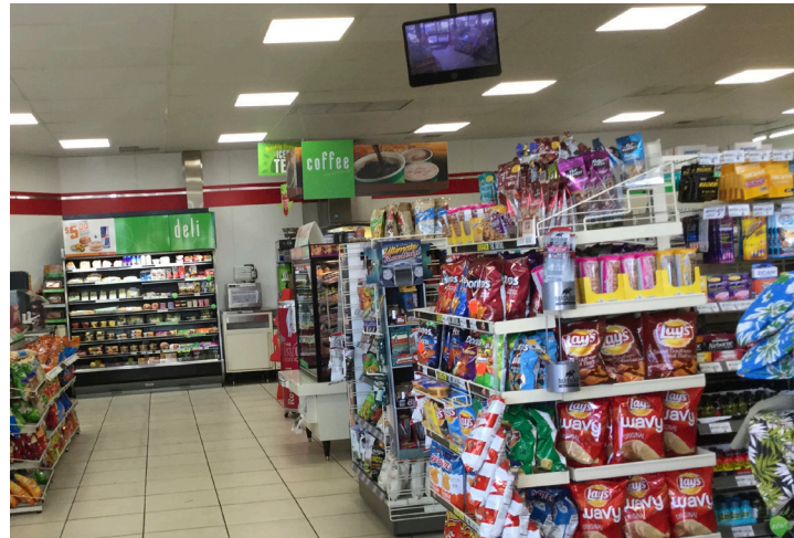
INTERIOR of a 7-11 in Dover, Delaware

exchange for her silence in their relationship, and then falsely claiming the money was for “legal expenses.”