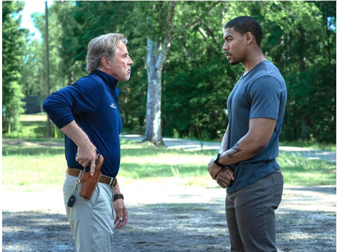
DON JOHNSON and Aaron Pierre star in "Rebel Ridge" (Netflix)

Saulnier — who dealt with frontier justice and lawlessness in his previous "Blue Ruin" and "Green Room" — has given this action-thriller loads of social context: racism, opioid addiction, the cash bail system, small-town funding and militarized cops.