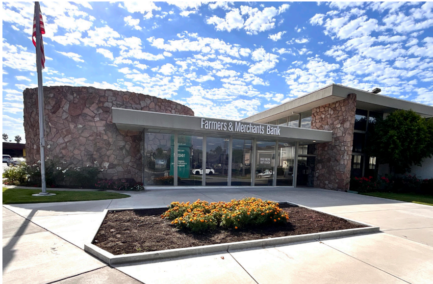
THE FARMERS AND MERCHANTS Bank at 10422 Garden Grove Blvd. may relocate to a five-story building at Euclid Street and the Boulevard.