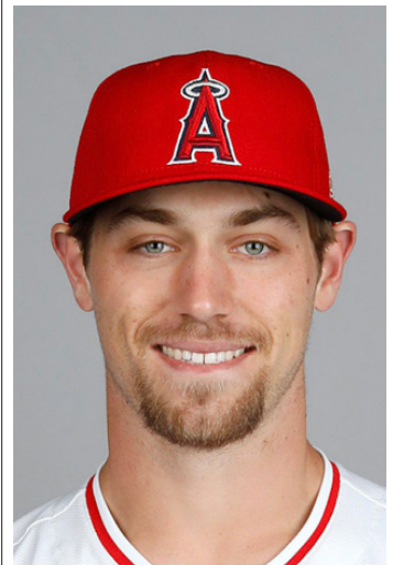
BEN JOYCE of the Angels can throw 105.5 miles an hour.