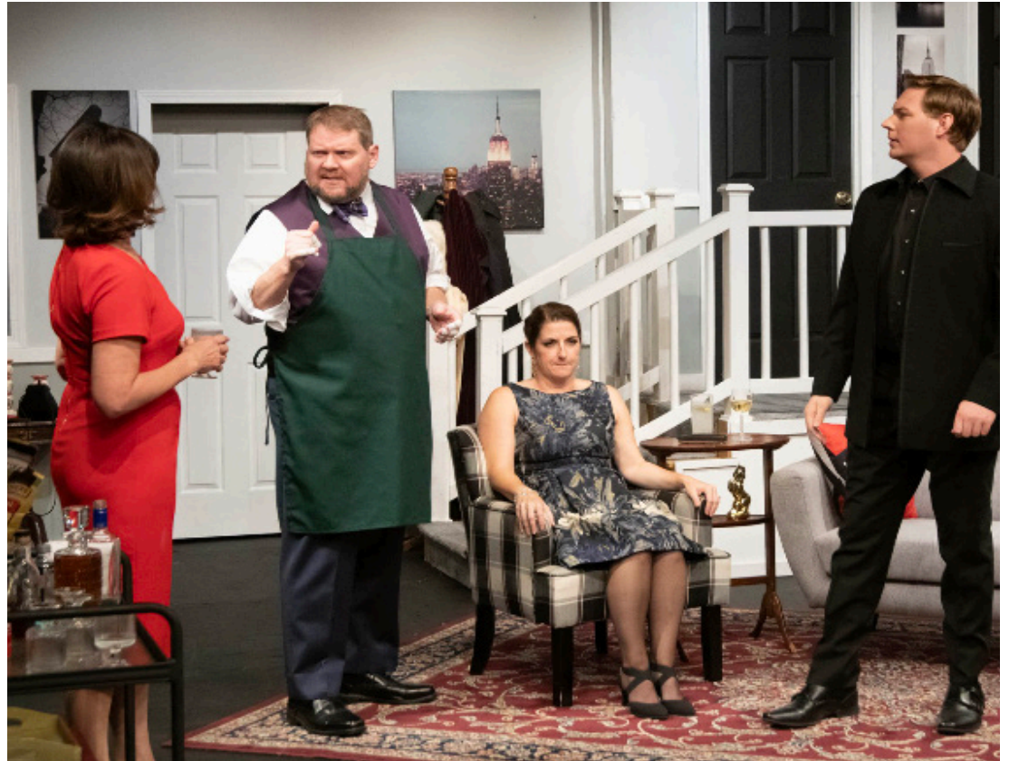
"RUMORS" is on stage at Westminster Community Playhouse through Sept. 22

The two couples begin comparing notes, rumors about the anniversary party that they've heard: one was having an affair? The other? Both!? When Ken spills the beans about Charley's injury,