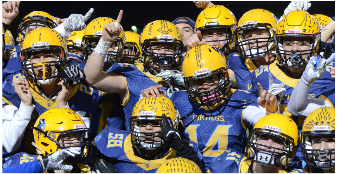
THE 2019 MARINA VIKINGS football team won the school's first CIF-SS football title. With a 4-0 start, could the 2024 version be headed for similar glory?