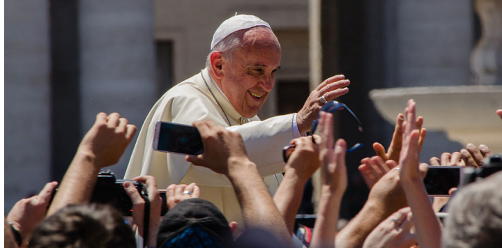
POPE FRANCIS criticized both Kamala Harris and Donald Trump and urged American Catholics to choose "the lesser evil".

The pope did not mention Kamala Harris or Donald Trump by name. He made his remarks in response to a question about what counsel he would give to