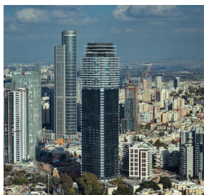
RAMAT GAN in Israel.

Today it is best-known for the Diamond Exchange Center, featuring many skyscrapers and high-tech businesses. It’s