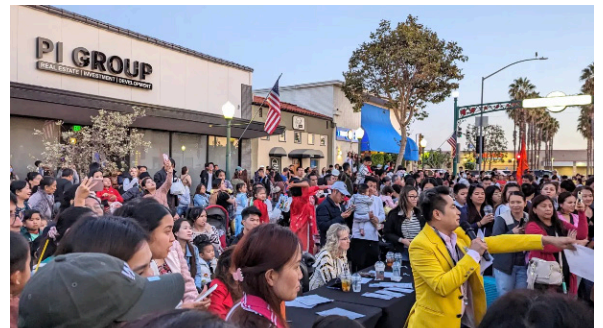
MOONCAKE FESTIVAL, 2023 (File photo).