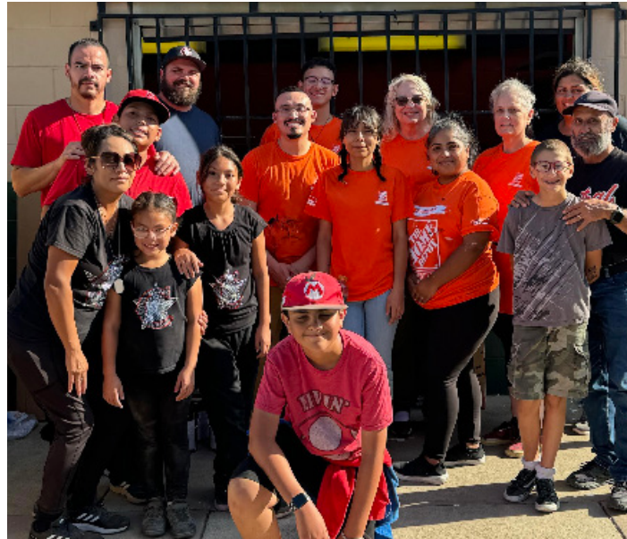
Parents, friends, players and volunteers from The Home Depot in Stanton recently renovate the snack bar for the Central Garden Grove Little League at Hare School Park on Chapman Avenue, just east of Magnolia Street in Garden Grove.