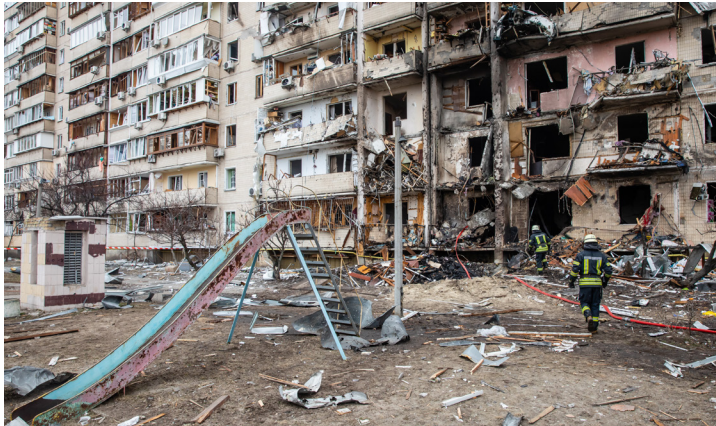
RUSSIA INVADED Ukraine in February 2022 (Wikipedia)

However, he supports the rights of states to create their own laws on regulation of the termination of pregnancies.