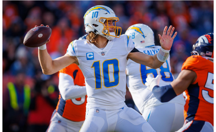
JUSTIN HERBERT completed 21 passes for 237 yards on Sunday against the Denver Broncos.

who missed the start of the game while being treated by the team's medical personnel for an irregular heartbeat, called it a "great and glorious win."