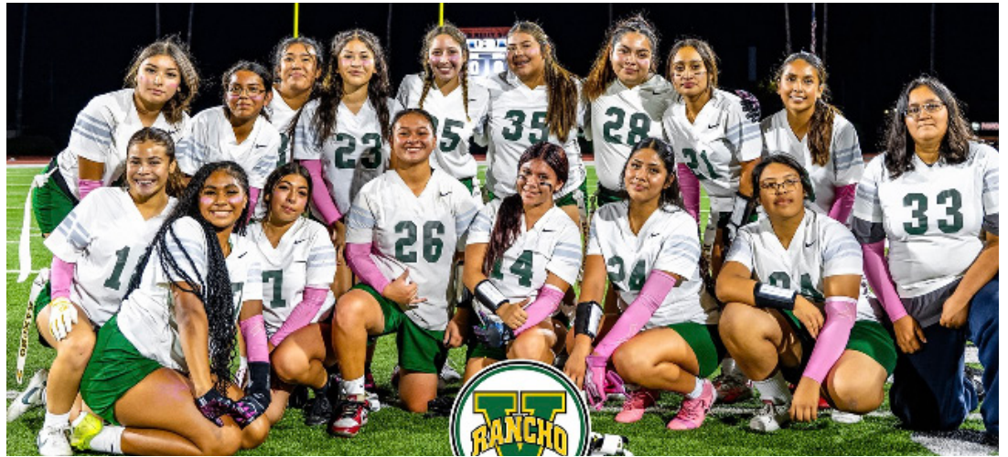
RANCHO ALAMITOS flag football team won the Grove League title and will advance to the CIF-SS playoffs next week.

Here are the schedules and records for the teams serving our