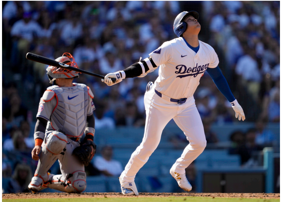
LOS ANGELES Dodgers' Shohei Ohtani reacts after flying out against the New York Mets during the fifth inning in Game 2 of the baseball NL Championship Series, Monday, Oct. 14, 2024, in Los Angeles.