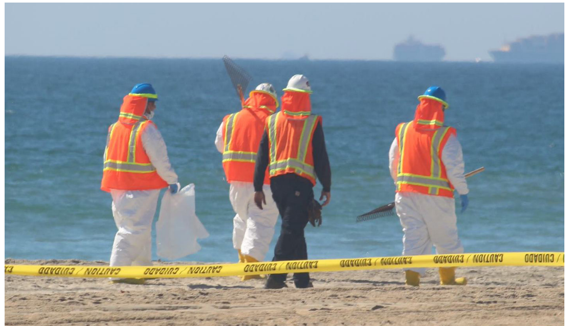
CLEANUP crews working the sand in Huntington Beach after the oil spill from a ruptured pipeline in October 2021.