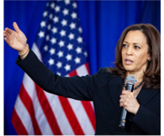
DONALD TRUMP and Kamala Harris intensify their campaigns

early voting in over 20 states and record highs are being reported in Georgia and North Carolina.