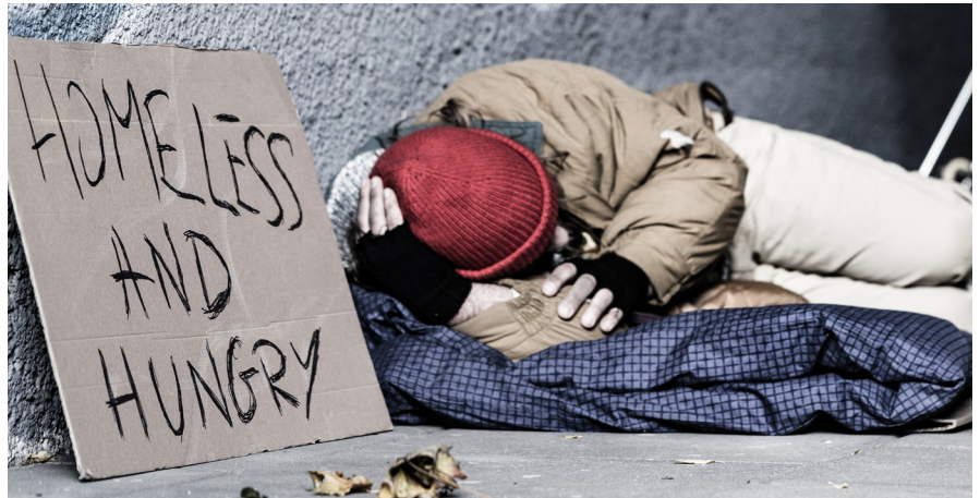
Empowered by a U.S. Supreme Court ruling, the Garden Grove City Council will consider an anti-camping ordinance aimed at problems associated with homelessness.

This new ordinance comes in consequence of the U.S. Supreme Court ruling in Grants Pass v. Johnson in