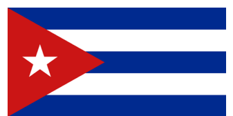
FLAG OF CUBA

Government officials say that the Cuban Electric Union “is working on its restoration” and Manuel Marrero Cruz, prime