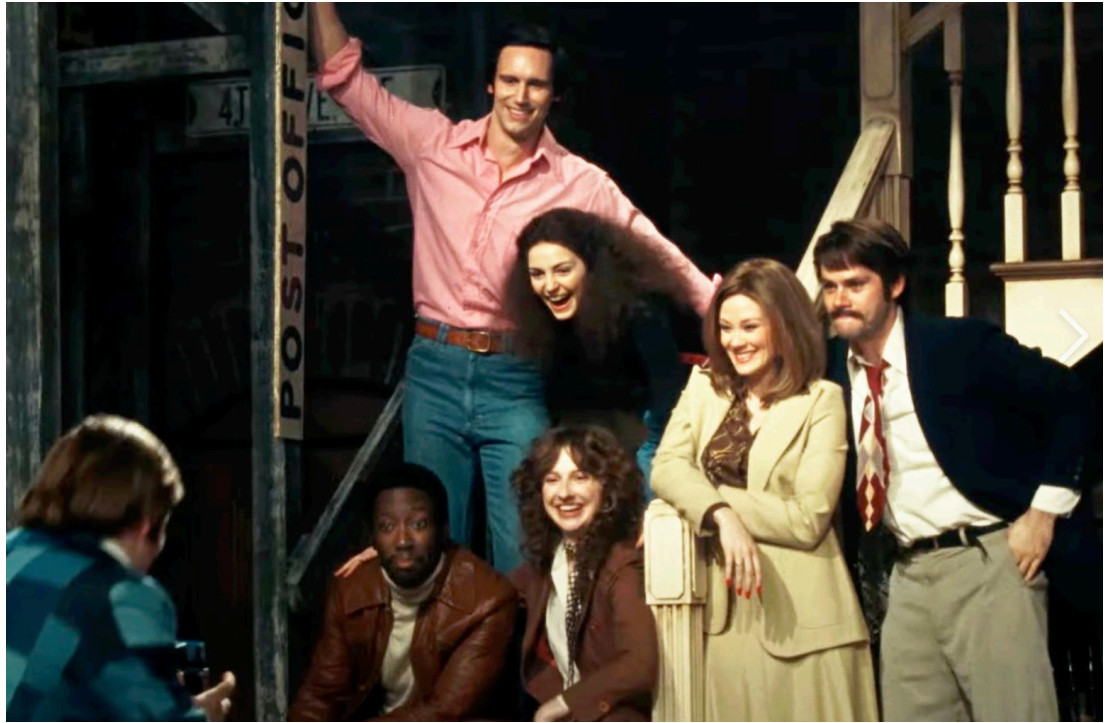
'SATURDAY NIGHT LIVE' is a celebration of the show's debut.

No, Reitman's movie is striving for a myth of "Saturday Night Live." Michaels' quest in the film — and though he never strays farther than around the corner from 30 Rock, it is a quest — is not just to marshal together a live show on this particular night, it's to overcome a cigar-chomping old guard of network television.