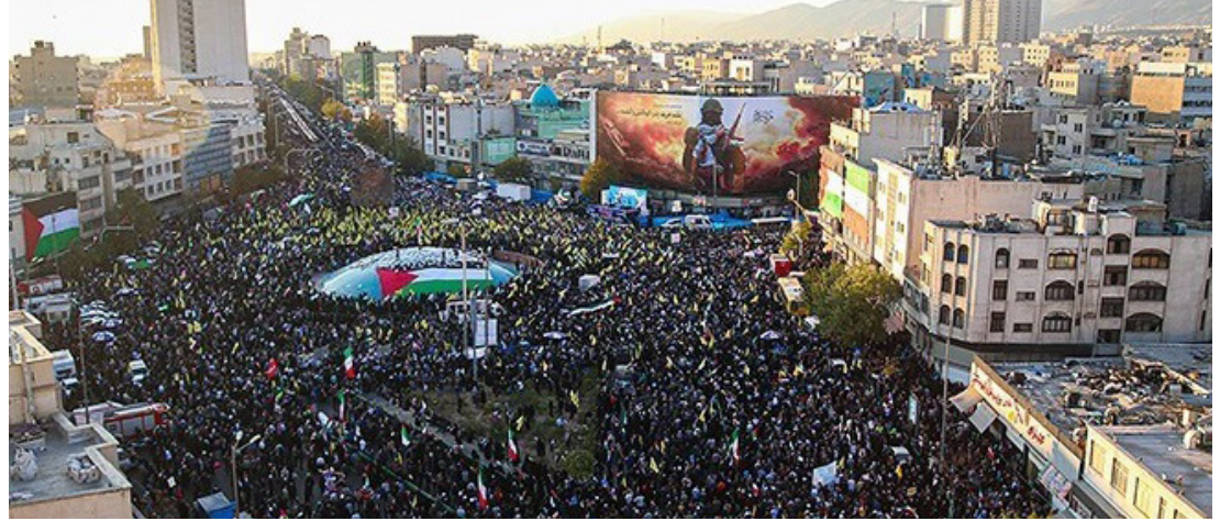
DEMONSTRATION in Iran over Israeli bombing of Gaza in November 2023 (Wikipedia).

Israeli Prime Minister Benjamin Netanyahu said “Iran made a big mistake tonight and it will