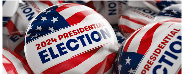
THE VICE PRESIDENTIAL DEBATE

That doesn’t include a series of small cross-border raids carried off by both sides.