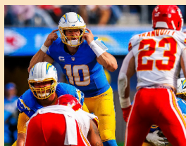
Tough Sunday SPORTS 6