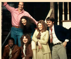
'Saturday Night' ARTS & LIVING 5