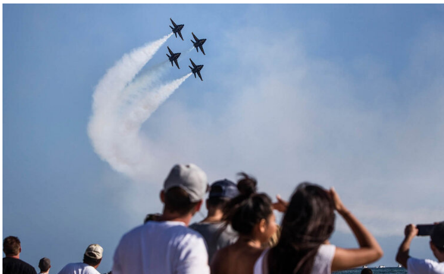
THE PACIFIC AIR SHOW will be in the skies over Huntington Beach and the Orange County coast starting on Friday and continuing through Sunday.