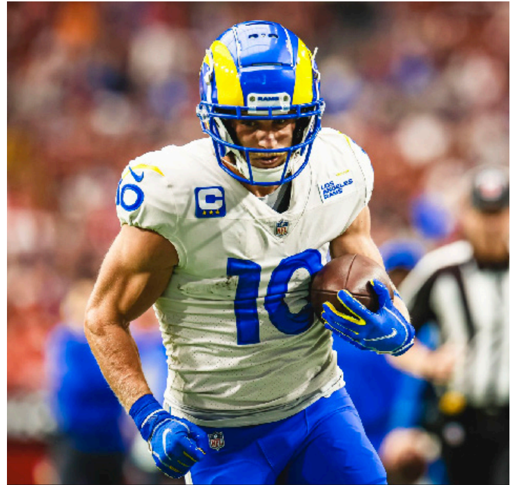
COOPER KUPP had an impressive return.

"That's not a move that we want to make," McVay said. "There was conversation in regard to people reaching out about (Kupp's availability), but to say that we were proactively seeking that out, that was something that I had a hard time with. ... He's a Ram, and we expect it to stay that way."