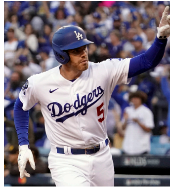
FREDDIE FREEMAN A dream come true

“It was like I was 5 years old playing ball in the backyard,” said Freeman a few moments after he turned fantasy into his-