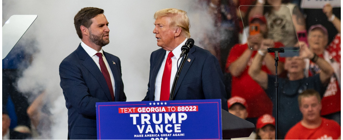
J.D. VANCE and Donald Trump campaigning in Georgia

been engaged in “cyberespionage” against the United States for years, targeting not just political figures and government officials but also American companies and infrastructure.