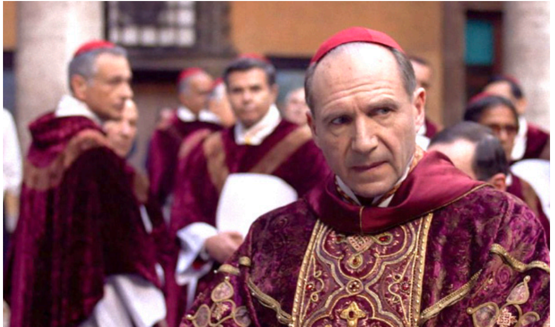
RALPH FIENNES stars in "Conclave" (Focus Features).

With many dreaming of ascending to the position, they're secluded from the outside world and left to their own devices to lobby for support.