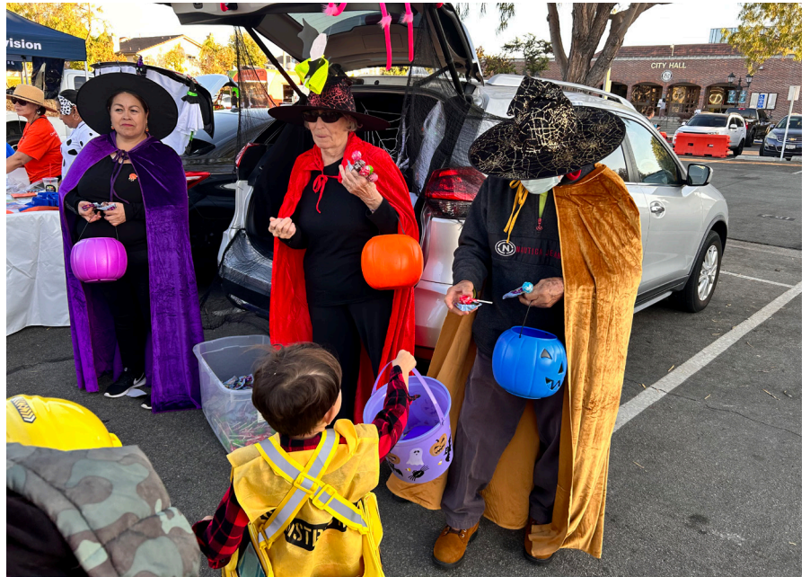
WESTMINSTER'S "SPOOKTACULAR" Halloween event featured music, food and a lot of "Trunk or Treating" in the Civic Center on Friday evening. The three witches above handing out candy were reminiscent of Shakespeare's "MacBeth.".