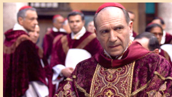
"Conclave" is holy war ARTS & LIVING 5