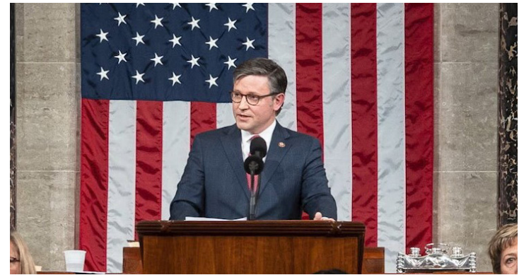
MIKE JOHNSON is Speaker of the House.