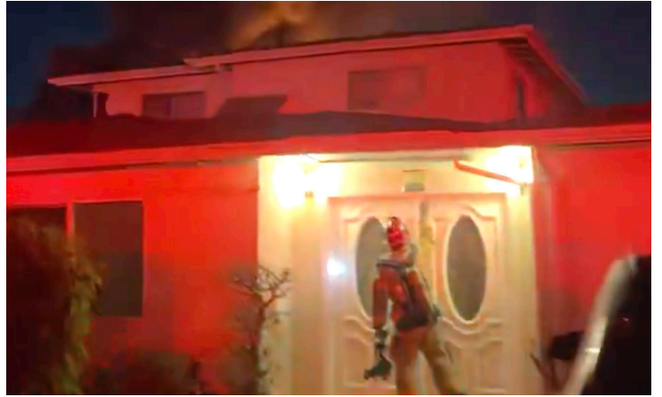
FIREFIGHTERS kept fire on Reading Avenue in Westminster from spreading to adjacent homes.

Firefighter paramedics checked the resident for injuries but