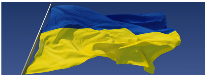
FLAG OF UKRAINE

The addition of North Koreans may just be part of a larger effort. The New York Times is reporting that about 50,000 troops have massed in a combined planned assault.