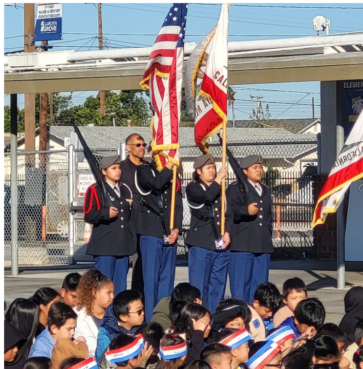
THIS CEREMONY with the presentation of flags by an honor guard at Hazard Elementary School in Santa Ana (part of the Garden Grove Unified School District) was held recently honoring the men and women who have served in the military for the United States of America since 1776.