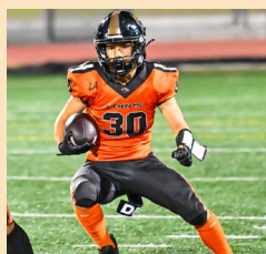
SPORTS Page 6