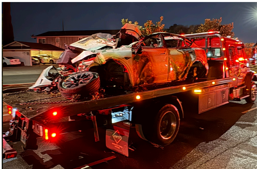
CHARRED BODY of a car in a fire in Garden Grove over the weekend