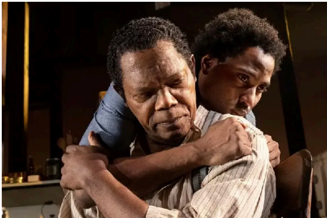
SAMUEL L JACKSON and John David Washington in "The Piano Lesson" (Netflix).

It even opens on a big, action-filled set piece in 1911, during which the piano is stolen from a white family's home. Another fleshes out Doaker's monologue in which he explains to the uniniti-