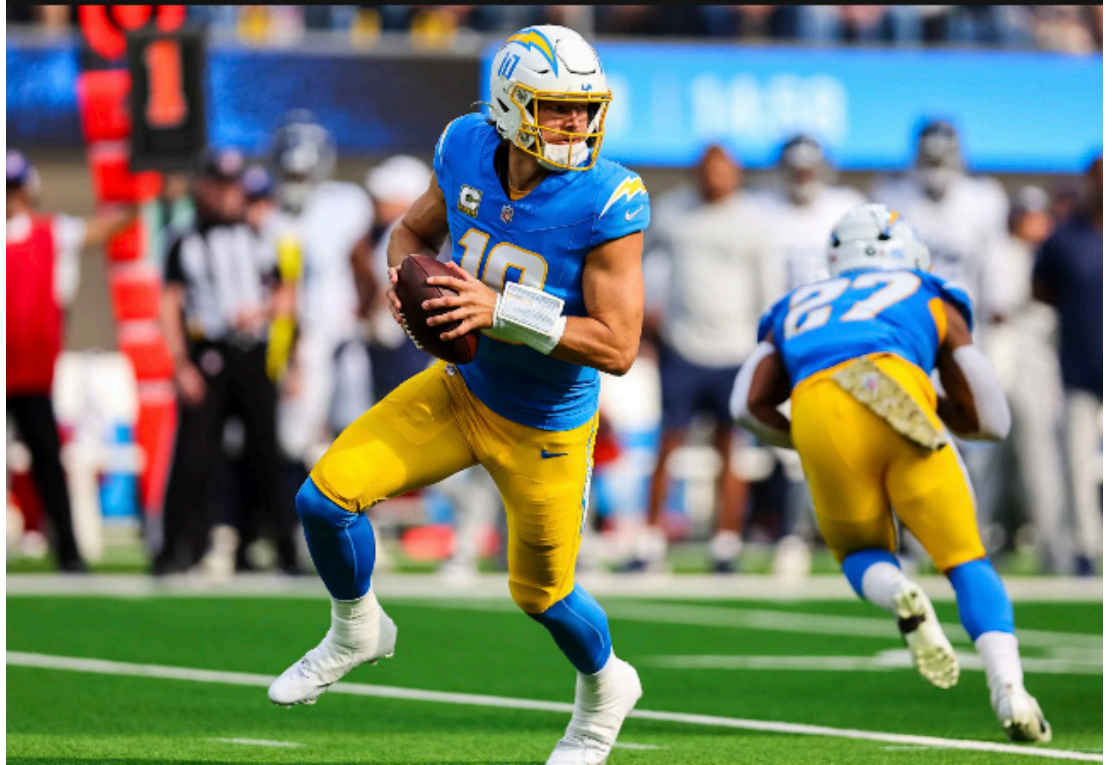
JUSTIN HERBERT has led the Chargers into a strong playoff position.

“A complete, total team win. When you look at the offense, the drives that we put together ... tough, gritty type of conver-