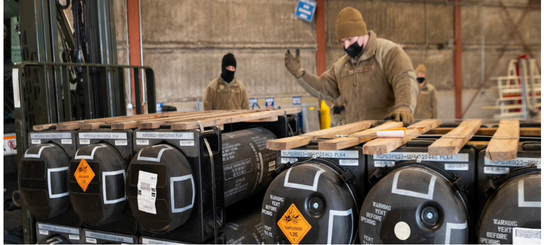
ARMAMENTS SHIPPED TO Ukraine from the U.S and Europe.

The move comes because of uncertainty over what President-elect Donald Trump and the new