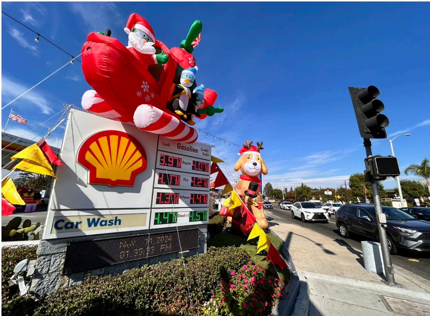
IN CASE you've forgotten what time of year this is, there's a whole bunch of inflated reminders at this service station at Chapman Avenue and Euclid Street in Garden Grove including Santa and his sleigh and a turkey.