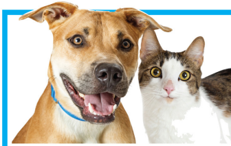
DOGS AND CATS AGREE:

The GGUSD serves most of Garden Grove as well as parts of Anaheim, Cypress, Fountain Valley, Santa Ana, Stanton and Westminster.