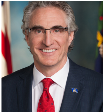
DOUG BURGUM North Dakota governor

"This council will oversee the path to U.S. ENERGY DOMINANCE by cutting red tape, enhancing private sector investments across all sectors of the Economy, and by focusing on INNOVATION over longstand-