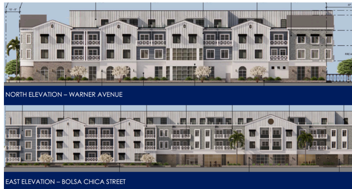
ARTISTS' RENDERING of north and east elevations of the proposed Bolsa Chica Senior Care Community Project.

and breakfast establishments in residential mixed-use areas in Stanton.