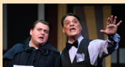
ARTS & LIVING 5