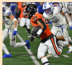
SPORTS Page 6