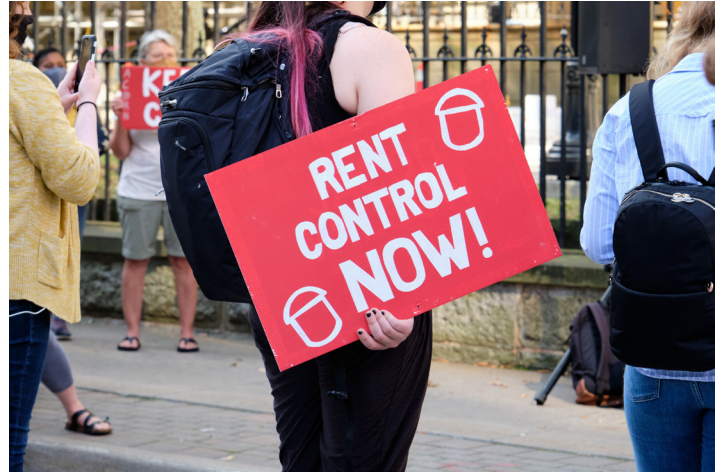
A RENT CONTROL demonstration in Halifax in Canada.

• approved an ordinance banning the sale of flavored tobacco by tobacco retailers in the city;