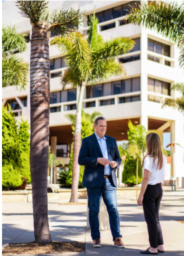
TONY STRICKLAND , currently a member of the Huntington Beach City Council, is seeking a return to Sacramento.