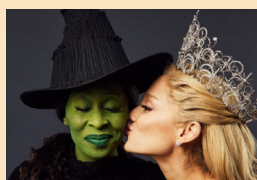
ARTS & LIVING Page 5