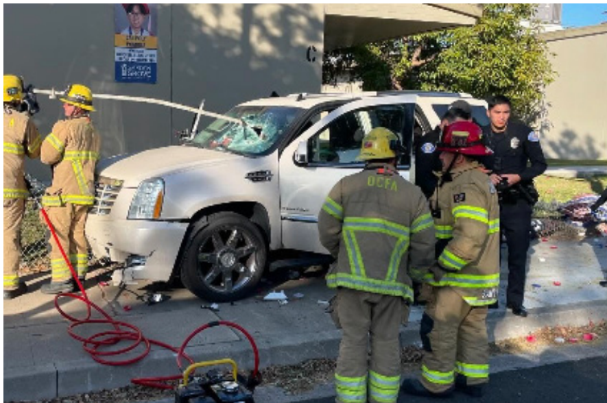
Orange County Fire Authority units were recently called upon to rescue two motorists whose vehicles went out of control in Garden Grove and trapped the occupants. Above, OCFA work on a vehicle at Trask Avenue and Taft Street. Another incident took place in the 7500 block of Garden Grove Boulevard in which a car overturned.