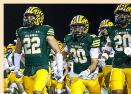
SPORTS Page 6

Chargers play for the CIF-SS championship