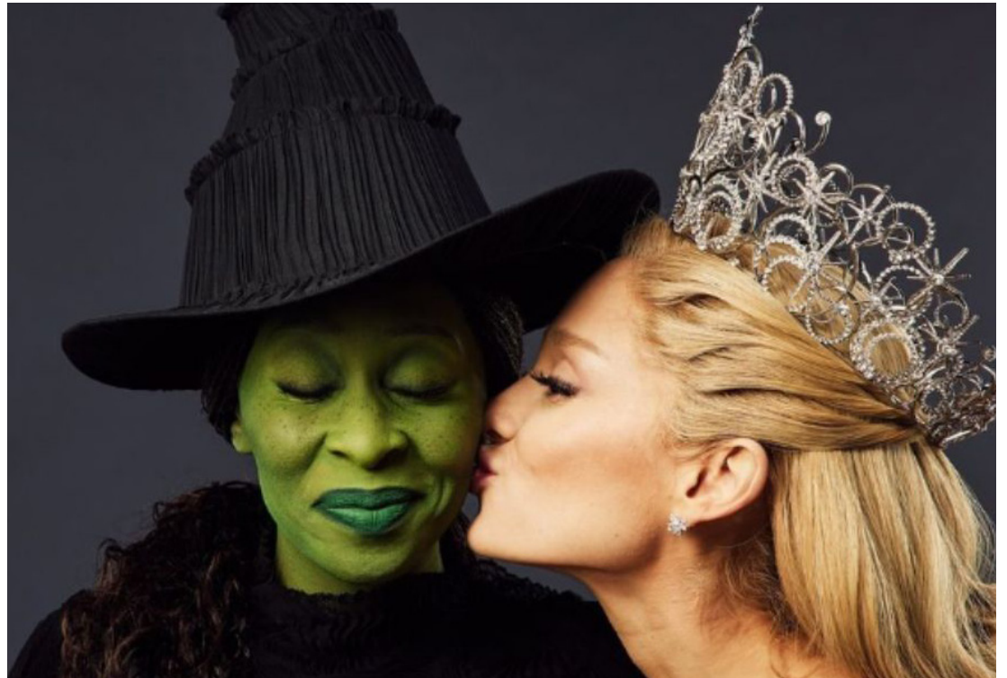
CYNTHIA ARIVO (left) and Ariana Grande in "Wicked" (Universal Studios).

Tricky question. Some people just don't buy into the musical thing, and they should be allowed to live freely amongst us. But if people breaking into song delights rather than flummoxes you, if elaborate dance numbers