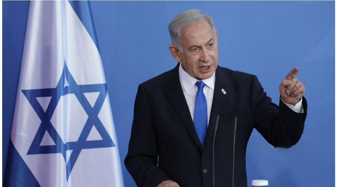
ISRAELI Prime Minister Benjamin Netanyahu.

ment, Israel would withdraw its forces from Lebanon, Hezbollah would move north – further from Israel – and the Lebanese Army would be positioned