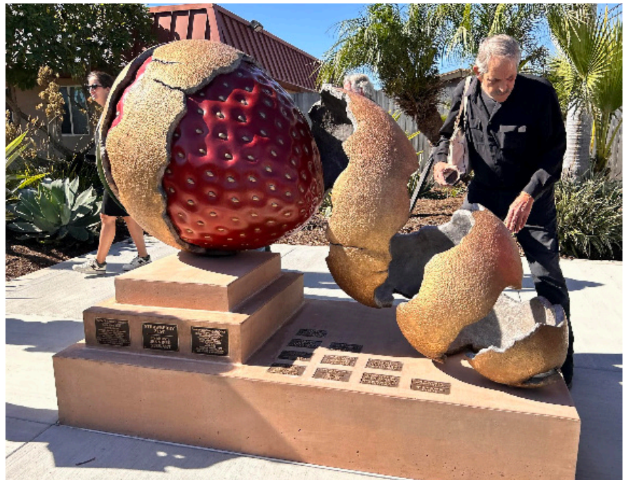
“STRAWBERRY ZEST” is newest landmark for Garden Grove. The sculpture – created by Jennifer Stewart – was unveiled Monday at the fire station on Valley View Street.