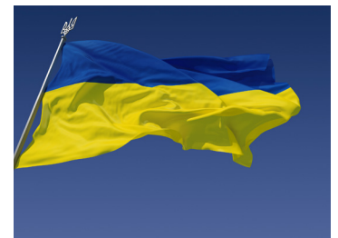
FLAG OF UKRAINE

“Together with the world, we must do everything to ensure that this Russian step toward