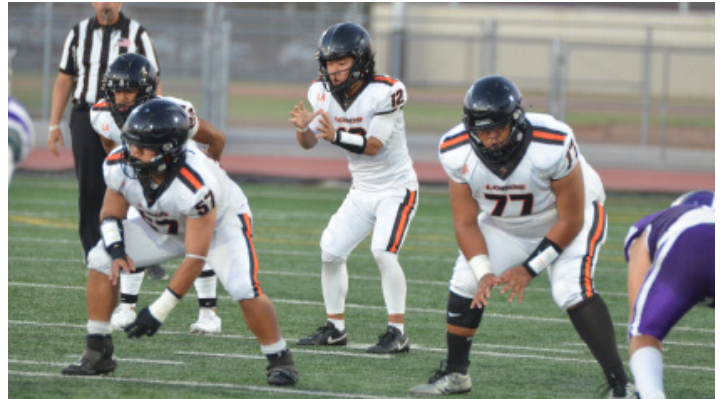
LOS AMIGOS (in white) has the best record among area teams with a 10-0 mark and the Sigma League Championship.

FRIDAY Division 3 North Torrance at Edison Division 5 Western at Huntington Beach Division 7