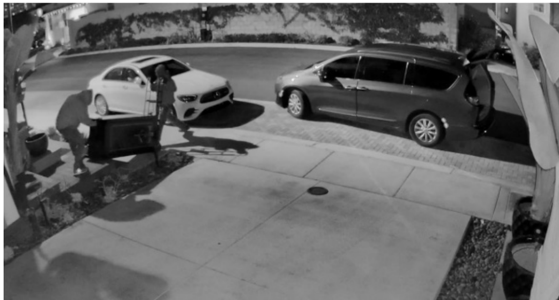
SECURITY CAMERA FOOTAGE robbers moving a safe from a house on Gardenia Avenue. in Garden Grove on Halloween night.