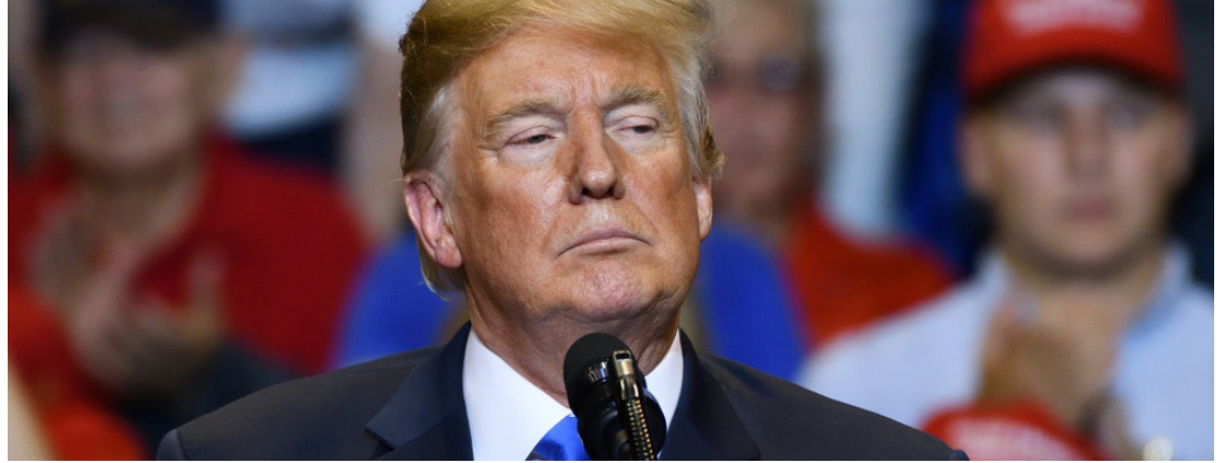
DONALD TRUMP has won the 2024 presidential election

As of 3:30 a.m. Wednesday, the Associated Press has “called” 277 electoral votes for Trump and 224 for Harris. To win, a candidate needs 270 votes. Trump, who will be only the second president ever to win nonconsecutive terms, won or is winning all the “swing” states. Grover Cleveland (1884 and 1892) was the first.