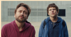
ARTS & LIVING 5