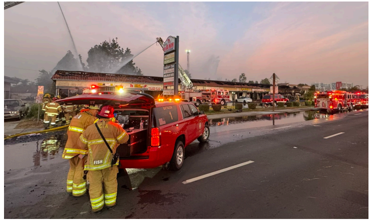
FIREFIGHTERS mopping up blaze at a strip mall in Garden Grove on Wednesday morning.

Traffic on Brookhurst Street was blocked for a time.