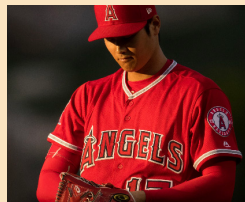
SPORTS Page 7

Here's the pitch: Shohei will, but not for a while