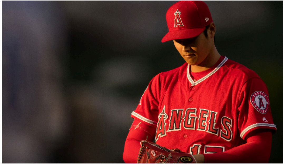
SHOHEI OHTANI has not pitched since he left the Angels in 2023.

The two-way star did not pitch this year while recovering from elbow surgery on Sept. 19, 2023. "We're going to take it piece by piece and get through this and then take it in one-, two-week