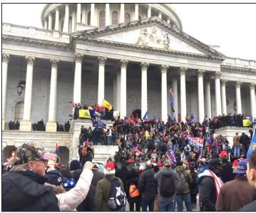
JAN. 6, 2021 RIOT

According to United Press International, Federal Judge Tanya Chutkan granted Smith’s request “shortly” after it was made. There was a “consensus” among Justice Department officials that there can be no trials of Trump