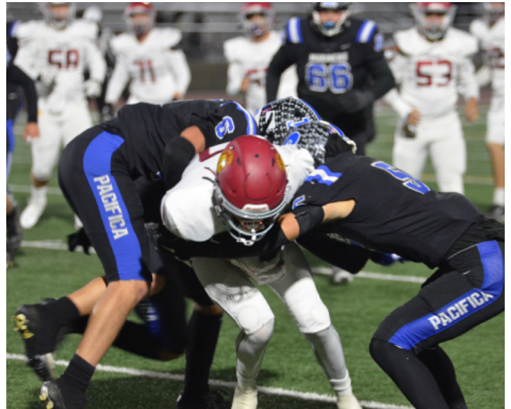
PACIFICA DEFENDERS wrap up La Canada ball carrier in CIF-SS football action Friday night at Bolsa Stadium.

In Division 10 play, Pacifica won a defensive battle, defeating La Canada 7-3 after being held scoreless for most of the game. The Mariners are now 6-5 after winning six consecutive games and grabbing the Omnicon League title.