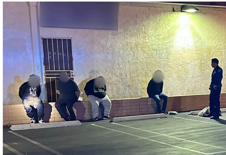
SUSPECTS in Home Depot robbery try.

no injuries and the cause of the fire is under investigation, according to the OCFA.