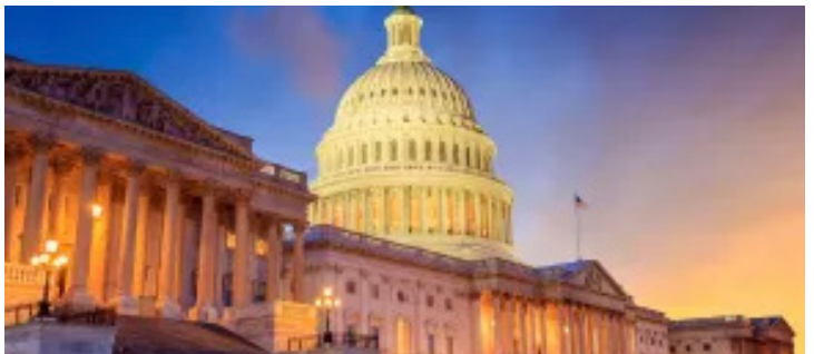
U.S. CAPITOL building at night.

Therefore, the GOP needs to win seven of the remaining races, with the Democrats needing 15.