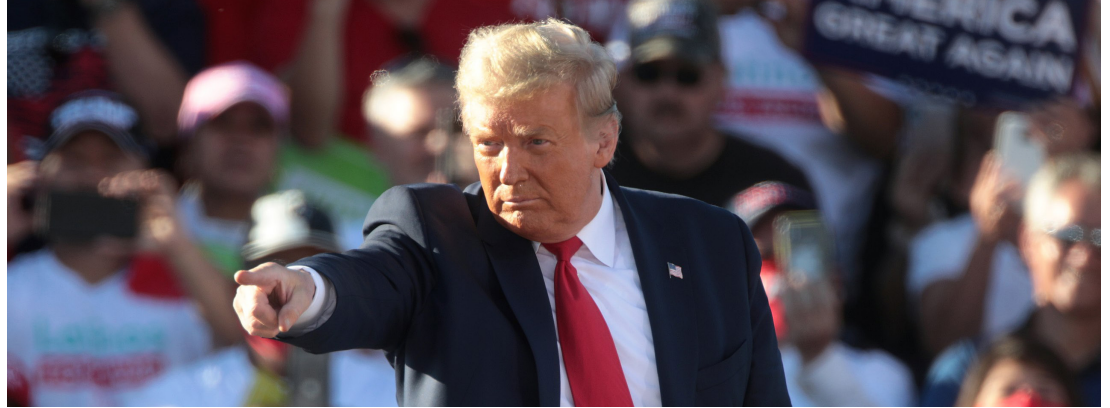
DONALD TRUMP was the target of an assassination plot tied to Iran

Shakeri is at-large and is believed to be in Iran at present. Charged and arrested in New