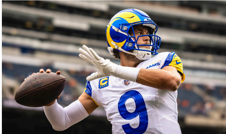
MATTHEW STAFFORD (Brevin Townsell/Rams photo).

The coaching staff's work is looking better and better now