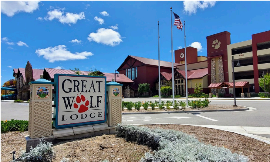
THE GREAT WOLF LODGE on Harbor Boulevard in Garden Grove.