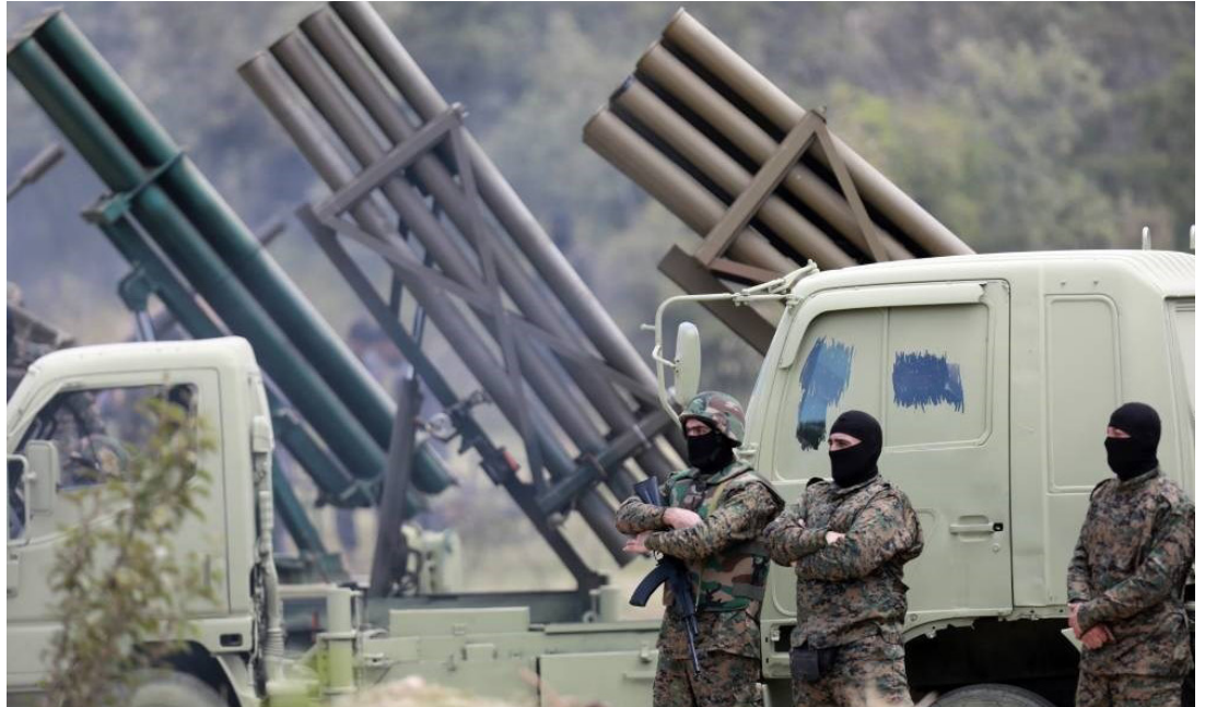
HEZBOLLAH ROCKET LAUNCHERS in Lebanon.

Reports from China's state-run Xinhua news agency said that 19 airstrikes were conducted on