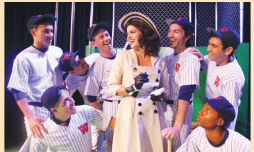
"DAMN YANKEES" in 2016 at the Gem.

"Avenue Q," a not-for-children event, is scheduled for Sept. 4-Oct. 12, followed by "The