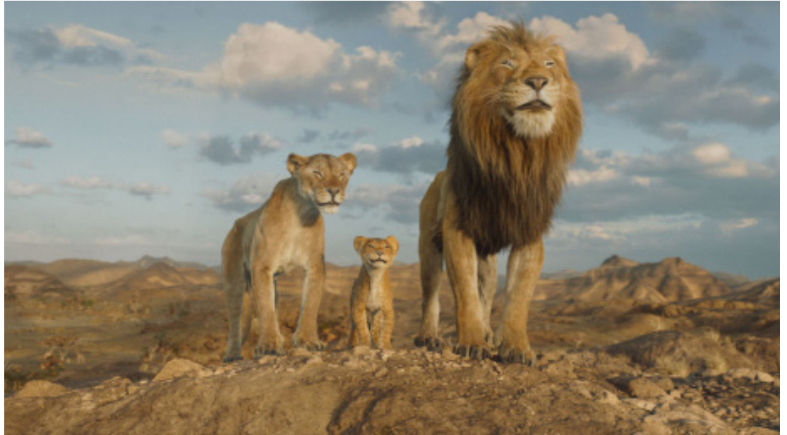
"MUFASA: THE LION KING" is a prequel to the original film (Walt Disney Studios release.)

In this telling, Scar was once Taka (Kelvin Harrison Jr.), destined to be king of his pride, and Mufasa was a lost cub, separated from his parents in a dramatic flood. Taka saves Mufasa and brings him into his family. His mother (Thandiwe Newton) embraces the newcomer; his father (Lennie James) rejects him as nothing but a stray. Not that it matters much to the cubs; both are thrilled to have a brother. They play and protect one another and grow up together. But fissures start to appear in this foundation as Mufasa emerges as the exceptional one and Taka