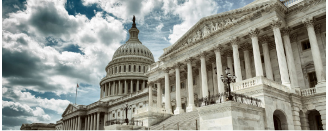
STORMY WEATHER over the U.S. Capitol.

ident-elect Donald Trump’s request for an increase in the debt limit.