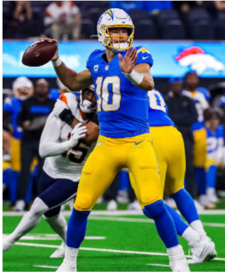
QUARTERBACK JUSTIN HERBERT passed for 284 yards and two touchdowns in the Chargers; come-from-behind win on Thursday against the Denver Broncos.