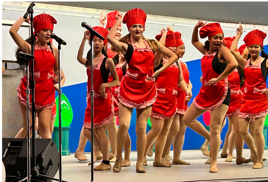
were all part of the entertainment on Friday night's "Jingle Jam" at Eastgate Park in West Garden Grove. It's an annual holiday event sponsored by the Team Tackney real estate firm. There were booths, contests, exhibits, food trucks, Santa Claus and more.