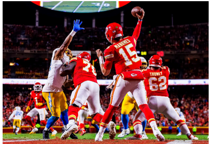
CHARGERS IMPROVING but it's tough to beat Patrick Mahomes and the Kansas City Chiefs.

The Chiefs have won six straight against the Chargers (8-5), with two being decided