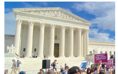
SUPREME COURT BLDG.

California receives a waiver from the EPA to enforce stricter