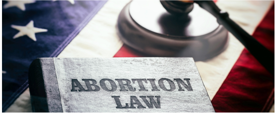
CAN ONE STATE sue over a prescription sent by another state? (Shutterstock).

The AP is reporting that access to such prescriptions are a major factor in statistics that are