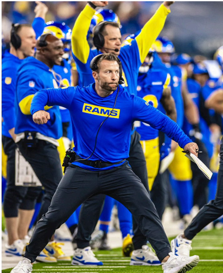
SEAN McVAY has had much success with the Rams. They've won four NFC West titles, had six playoff berths and a Super Bowl title in his eight years at the helm.

"I'm proud of this group and the way they battled back,"