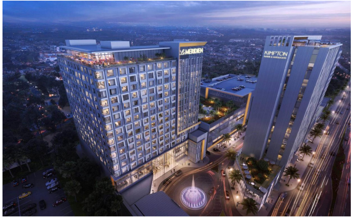
THE PROPOSED AURELA project on Harbor Boulevard in Garden Grove would include a Kimpton and Le Meridien hotel, but no sticks are in the ground yet (File photo).

Three of the four cities – Garden Grove, Huntington Beach and Westminster – have “navigation centers,” or access to them, but how much of an impact will