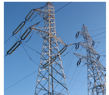
ELECTRIC POWER IS OUT

One theory is there was a failure in an underground power line leading to a “cascade” of failures at other power plants.