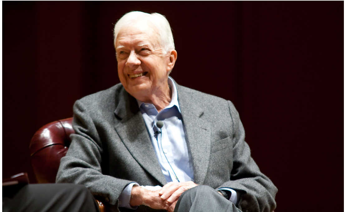
JIMMY CARTER in 2008. He died on Sunday at the age of 100 as the longest-living U.S president. Elected in 1976, he served in the White House from 1977-1981.

Carter took responsibility for the disaster. When was the last