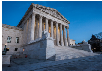
U.S. SUPREME COURT

He noted that violence is increasingly aimed at judges for their actions in court and that there has been a rise in the number of judges or their relatives killed because of rulings issued from the bench.