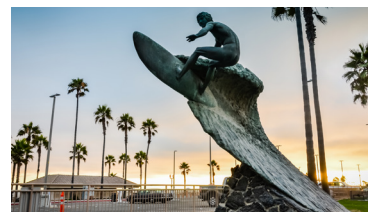
SMOOTH SURFING in court?

Question: Who will be the winners – other, perhaps than the attorneys – in several ongoing or potential major lawsuits with the potential to affect Huntington Beach? Surf City is embroiled in a long-running legal battle over its refusal to submit a “housing element” accepting a responsibility to zone for over 13,000 new housing units. It’s also been sued