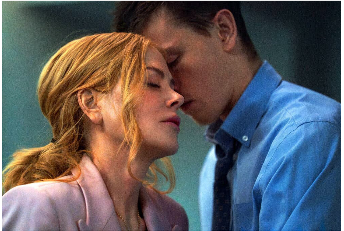
NICOLE KIDMAN and Harris Dickinson in "Babygirl" (A24)

The opening moments of "Babygirl," which A24 releases Wednesday, are of Kidman in close-up and apparent climax.