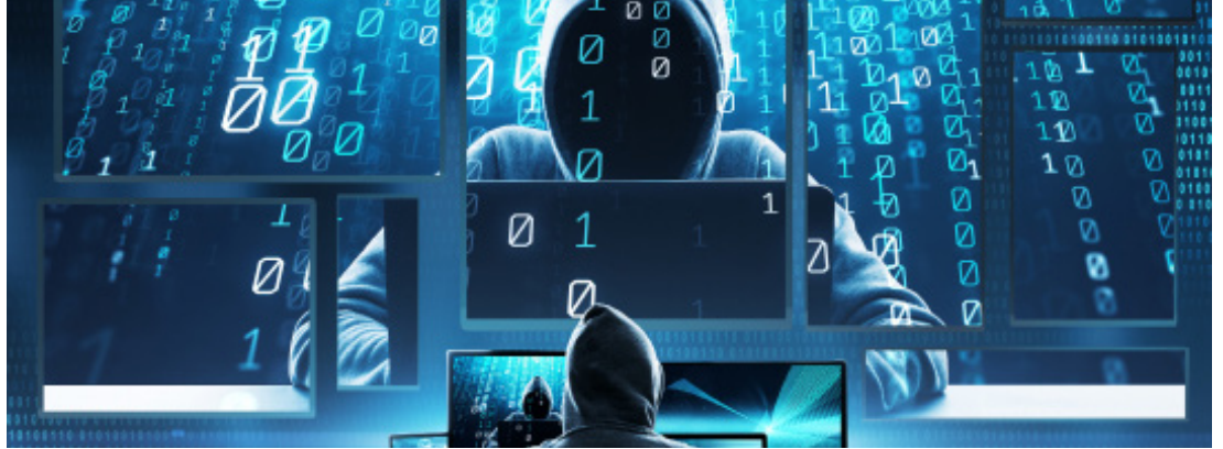
TREASURY DEPARTMENT taking action against cyber attacks (Shutterstock).

In addition to creating fake websites intended to look like authentic news organizations and, in some cases, they paid U.S. companies to disseminate the