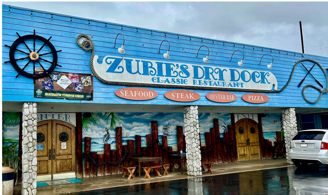
ZUBIE'S DRY DOCK has been an Orange County staple for decades.