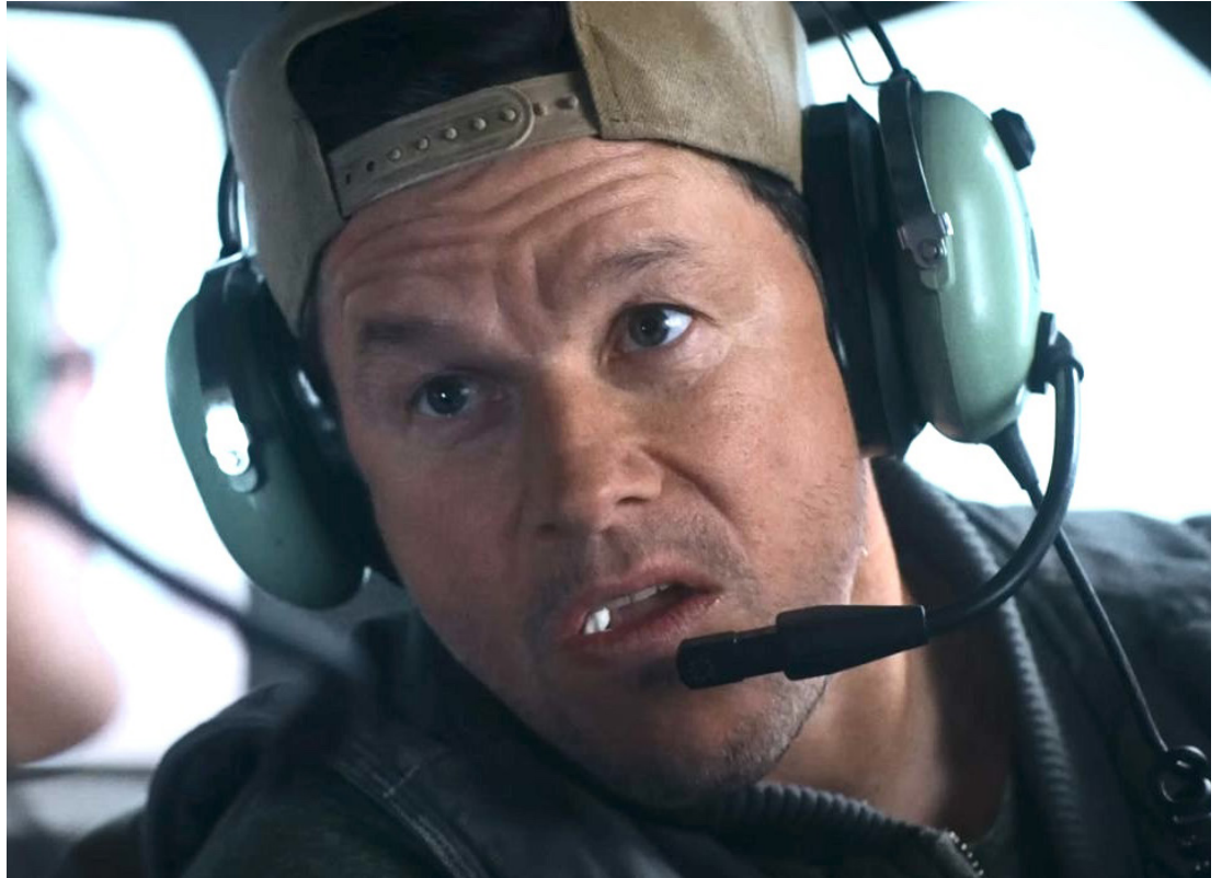
MARK WAHLBERG stars as a crazy pilot in "Flight Risk" (Lionsgate).

Wahlberg is the most fascinating misfire. His character is listening