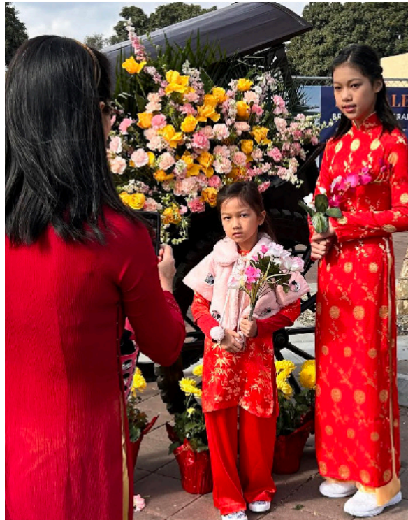
TAKING PHOTOS of flower-y scenes was a principal delight in “Flower Street” on Garden Grove’s Main Street Saturday and Sunday (OCT photo).

Themed “A Spring of Remembrance,” this event is