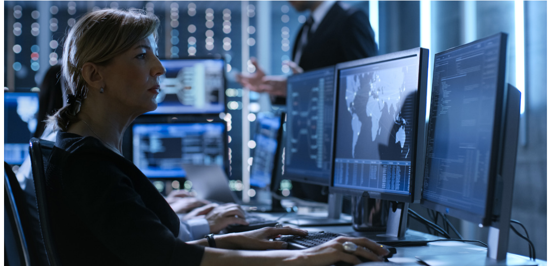
THE TRUMP ADMINISTRATION is seeking a major downsizing of the federal workforce