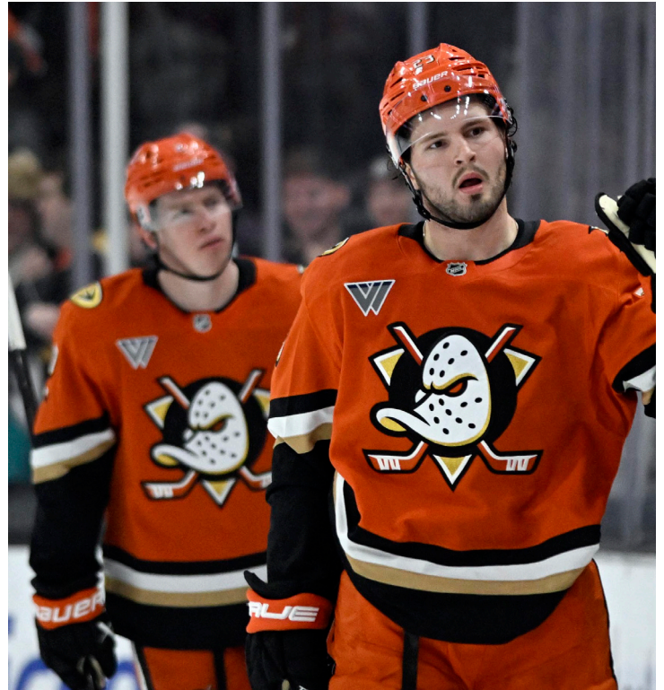
ANAHEIM DUCKS center Mason McTavish celebrates with teammates after scoring against the Nashville Predators during the second period of an NHL hockey game in Anaheim, Calif., Saturday, Jan. 25, 2025.

The Ducks trailed 3-2 after one period, but outscored the home team 4-1 the rest of the way.