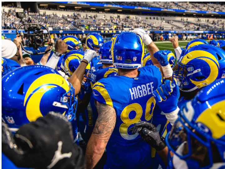
THE RAMS have spirit, but the team's offense will need to step up if a deep run into the playoffs is sought

Los Angeles will host the Minnesota Vikings (14-3) on Monday night in the Rams' first playoff game in Glendale, Arizona. To pull off the upset, the Rams will probably need to score a bunch of points, which has been a problem for their offense repeatedly in an otherwise outstanding second half of the season.