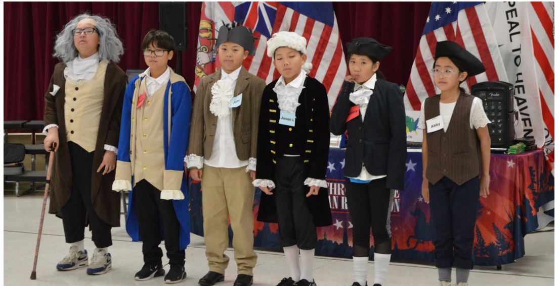
ARE YOU smarter than a fifth-grader... in American history? Maybe not, if you discuss it with a pupil at Ethan Allen Elementary School in Fountain Valley. At Allen, there was recently held an assembly called "Walk Through the Revolution," giving students immersive education about the history of America's founding as a nation. They took on the roles of key figures from that period and there were dramatic activities, flags, maps, re-enactments, music and more. Allen is part of the Garden Grove Unified School District.