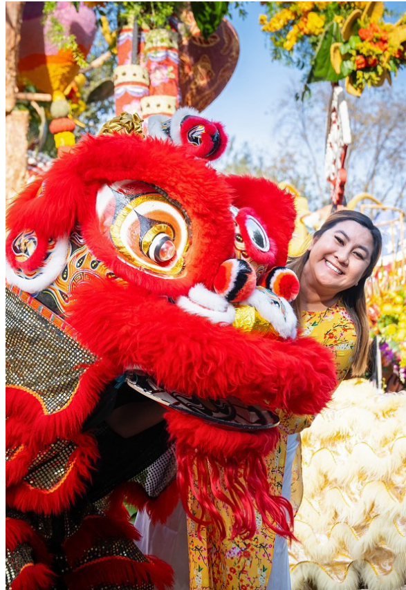
WESTMINSTER HIGH SCHOOL'S Vietnamese American Culture Club performed in the 2025 Rose Parade in Pasadena on New Year's Day. They presented various performances celebrating Vietnamese culture and community