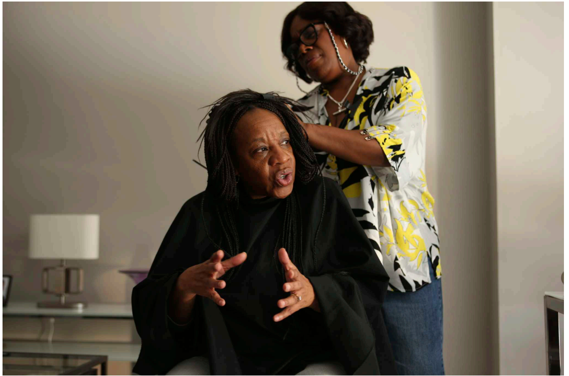
MARIANNE JEAN-BAPTISTE stars in "Hard Truths" (Bleecker Street).

It's funny at times, heartbreaking at others and always fasci-