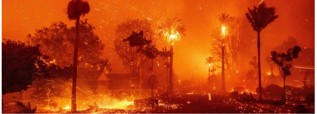
THE DEATH TOLL IS now at 11 and 12,000 structures have been destroyed..

There have been 11 deaths confirmed, and it's feared that more fatalities will be discovered once the fires are extinguished and burnt areas searched for possible victims.