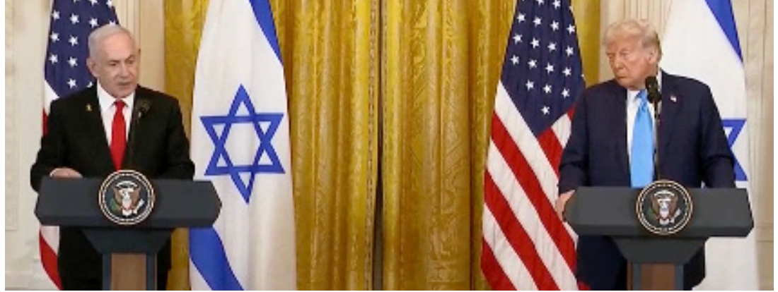
PRESIDENT DONALD TRUMP suggested Palestinians leave Gaza.

Before the press conference, Trump suggested that Jordan and Egypt offer a home to the