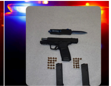
TRAFFIC STOPS for vehicle code violations led to the arrest of two men and the confiscation of drugs and firearms (WPD photo).

Grove Boulevard and Goldenwest Street when they made a stop of a car for vehicle code violations.