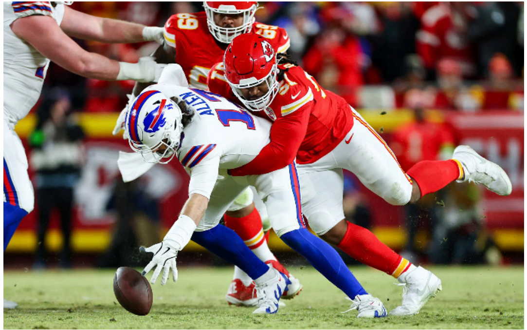
CHIEFS DEFENSE forces a fumble in Kansas City's American Football Conference championship game against the Buffalo Bills.