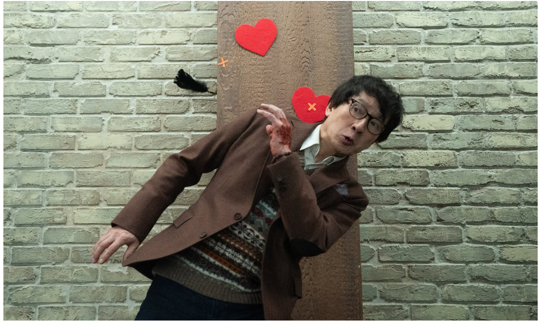
KE HUY QUAN leads action-comedy 'Love Hurts' from Universal Pictures.

But there's something immensely off about the tone, which isn't clever or silly enough to be funny, and its ham-fisted attempts to tie it to Valentine's Day with various subplots about love, from the jaded assistant who falls for a