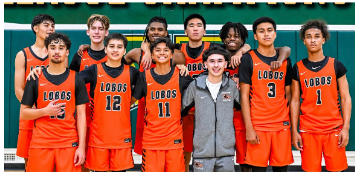
LOS AMIGOS' boys' basketball team won the Coast League title. The Lobos open CIF-SS play against district rival Santiago today

If they win, they will face the winner of the Palm Springs/Moreno Valley match in the semifinals on Tuesday. The championship game is on Saturday, Feb. 22 at Mt. San Antonio College.