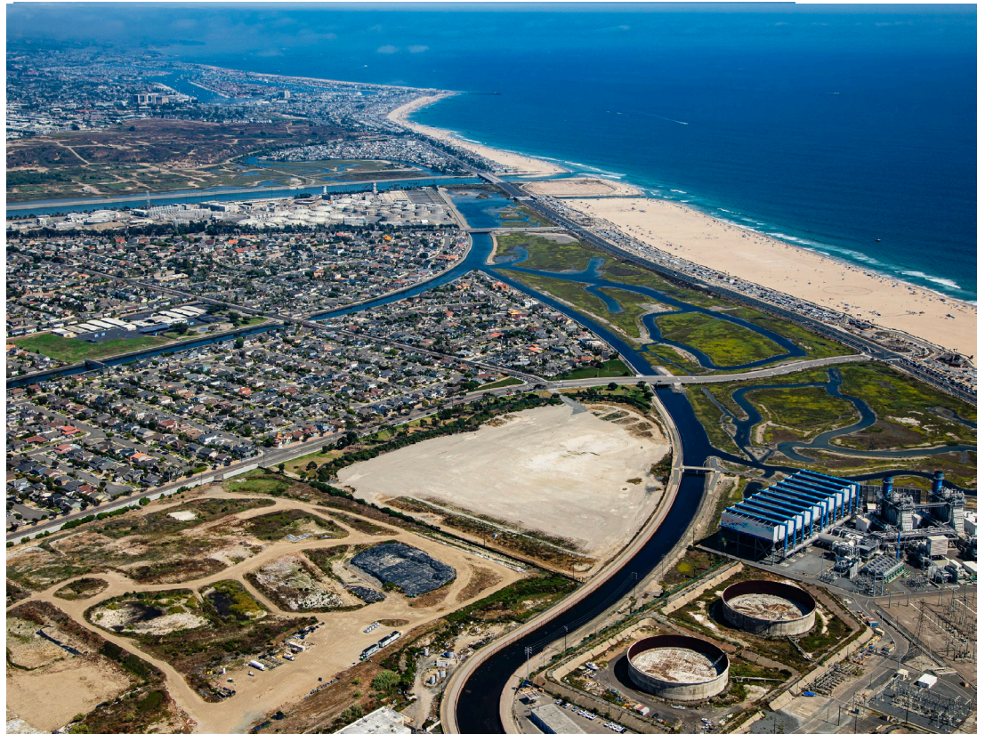
AERIAL VIEW of the Magnolia Tank Farm area, slated to become "Magnolia Coast."

OK, not exactly historically accurate unless you were born before 1846 (start of the Mexican-American War). And as long as we're looking at history, let's look at the "chain