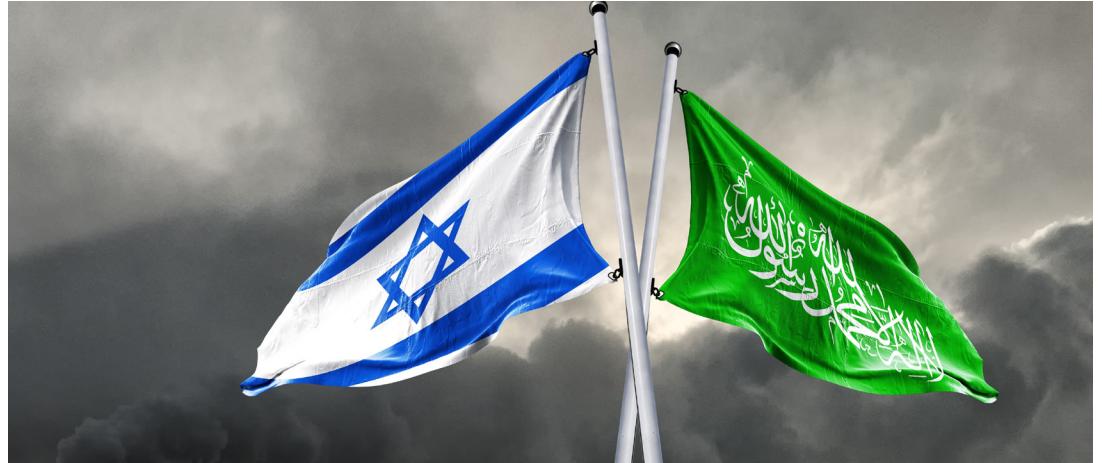
SNAGS have developed that may undermine the cease-fire agreement.

Hamas said on Monday and Tuesday that it planned to delay the release of three more hostages, accusing Israel of not meeting the terms of the cease-fire pact, which included providing a specific number of tents and other assistance.