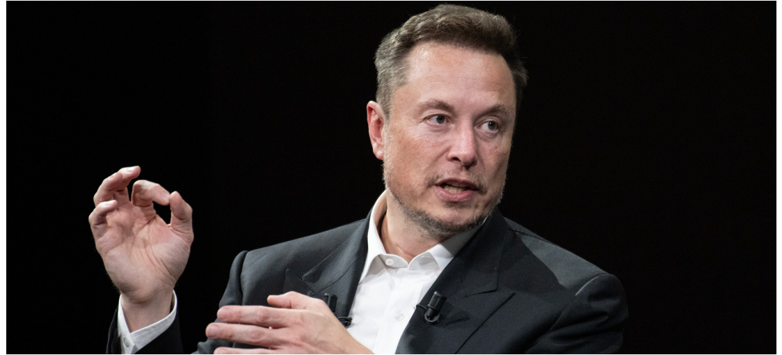
ELON MUSK leads the “Department of Government Efficiency”.

DOGE – which is not an official department of the federal government – was created with the premise of seeking to curb “wasteful” government spending.