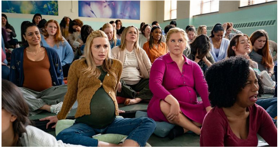
BRIANNE HOWEY (left) and Amy Schumer in "Kinda Pregnant" (Netflix).