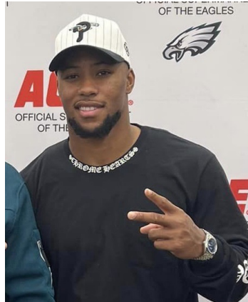
SEQUON BARKLEY

“This is gonna be our biggest test yet,” Kelce said. “They got