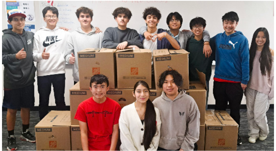
STUDENTS from Santiago High School in Garden Grove stepped up in response to the wildfires in Los Angeles County by organizing a relief drive for the residents of Altadena. Students and faculty donated essential items including toiletries, hygiene products, baby food, diapers, cleaning wipes, paper towels and toilet paper.