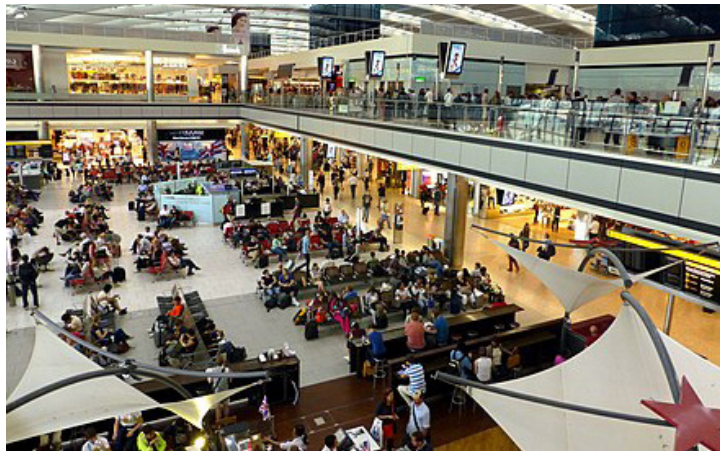
TERMINAL AT HEATHROW AIRPORT

a month from the four countries for two years with eligibility to work.