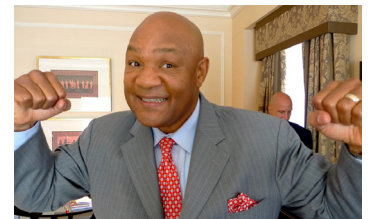
GEORGE FOREMAN in 2009.

Foreman became famous in the 1968 Olympic Games when he defeated the Soviet fighter for the gold medal and waved