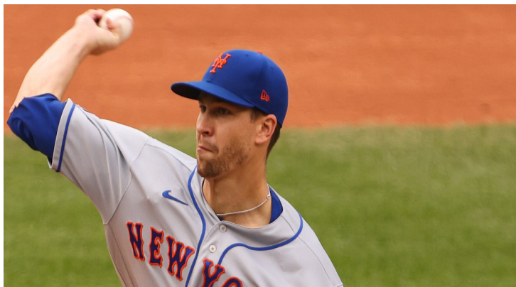
JACOB deGROM is back with the Rangers after leaving the Mets. He's won two Cy Young Awards.

4. Athletics: After an emotional 57th and final season in Oakland, when the A's showed progress with a 19-win improvement, their home for at least three seasons is a Triple-A stadium in Sacramento. They hope to start 2028 in Las Vegas, where their new stadium still has to be built. They still likely lack the depth needed to compete for a playoff spot after having MLB's lowest payroll for three straight seasons, but tripled the total number of $60 million deals in franchise history with three this offseason: for young outfielder Lawrence Butler ($65.5 mil-