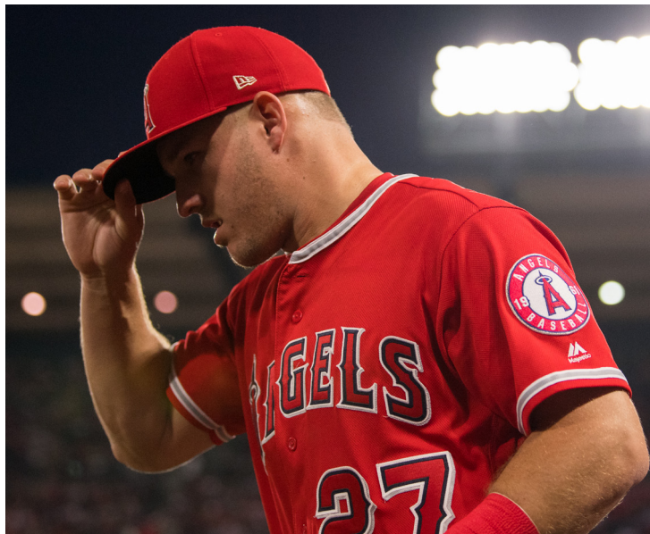
MIKE TROUT is healthy and back and relocated to right field for the Angels in 2025.

For his three titles with San Francisco from 2010-14, the Giants missed the playoffs after each of the first two, then rebounded to win another the fol-