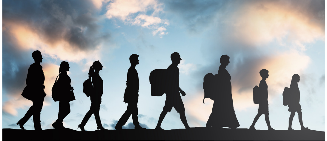
WORK-STUDY permits for those from Cuba, Haiti, Nicaragua and Venezuela are affected

There’s already a legal challenge to the order, filed on behalf of American citizens and immi-