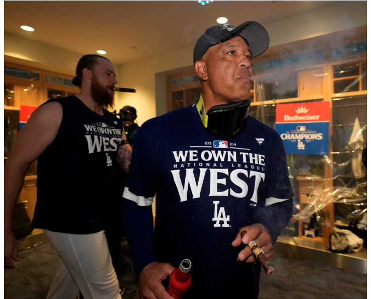
DAVE ROBERTS of the Los Angeles Dodgers is the winningest manager in baseball history.

1. Los Angeles Dodgers. The defending World Series-winning Dodgers have put their trust not only in Ohtani but also in manager Dave Roberts, who enters his 10th season with the highest winning percentage in major league history at .627 (851-507)