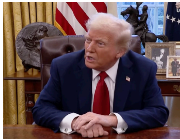
PRESIDENT DONALD TRUMP

He claimed –without evidence – that the 2020 presidential election was rigged and that he was the actual victor.