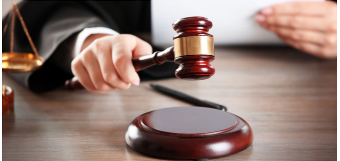
TWO FEDERAL JUDGES on Friday handed President Donald Trump a judicial victory and a defeat.

A federal court in New York on Friday ordered a halt to the Trump administration's plan to end the Voice of America.