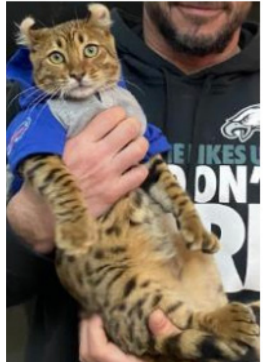
CLUBBER , the Bengal Lynx.

Officers received information that the animal