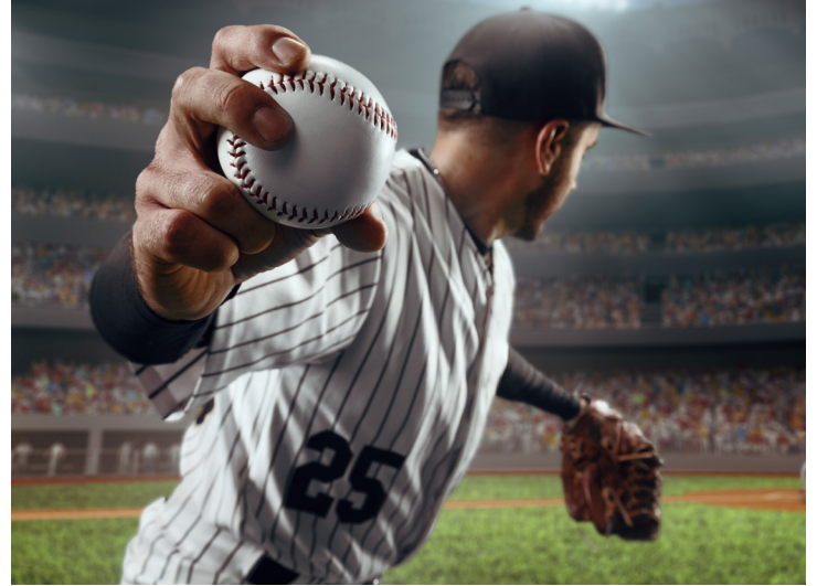
RESEARCH is showing that pitchers are throwing too hard and too young, making them vulnerable to problems (AP photo).

The study showed that major league pitcher injured list placements increased from 212 in 2005 to 485 in 2024. Days on the IL rose from 13,666 to 32,257.