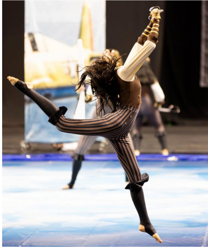
THE MARINA HIGH Color Guard had a stellar season, working its way up to the World Championships, where they competed in the semifinals for the first time.