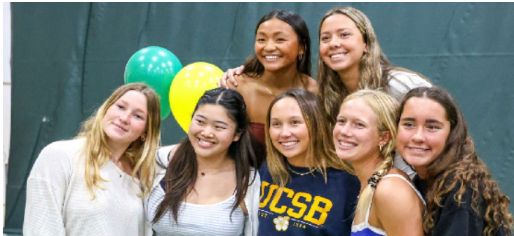
SOME OF THE female athletes at Edison High bound for glory at colleges and universities.