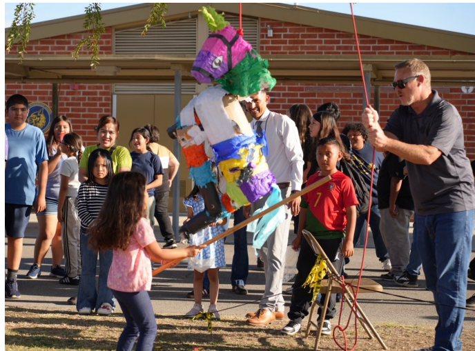
PINATA FUN at Walton Intermediate