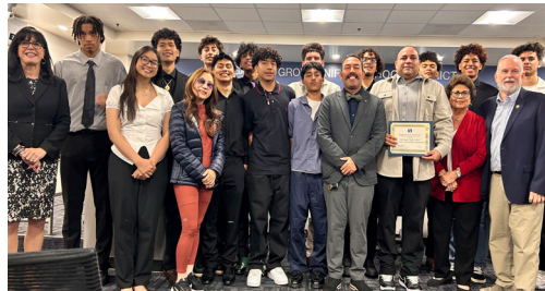
SANTIAGO HIGH boys' basketball team, coach and district officials.

The Santiago High School boy's basketball