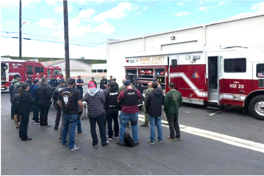
A REPORT of a possible burglary in progress in Westminster Friday morning led to the discovery of an alleged illegal drug lab.