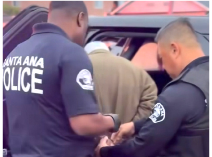
POLICE arrested a suspect in cat-killing spree in Santa Ana and Westminster.

Many any of the animals – the count is unknown – have been