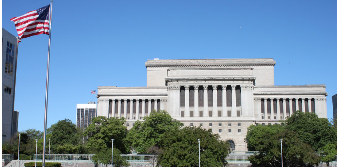
MILWAUKEE COUNTY COURTHOUSE.