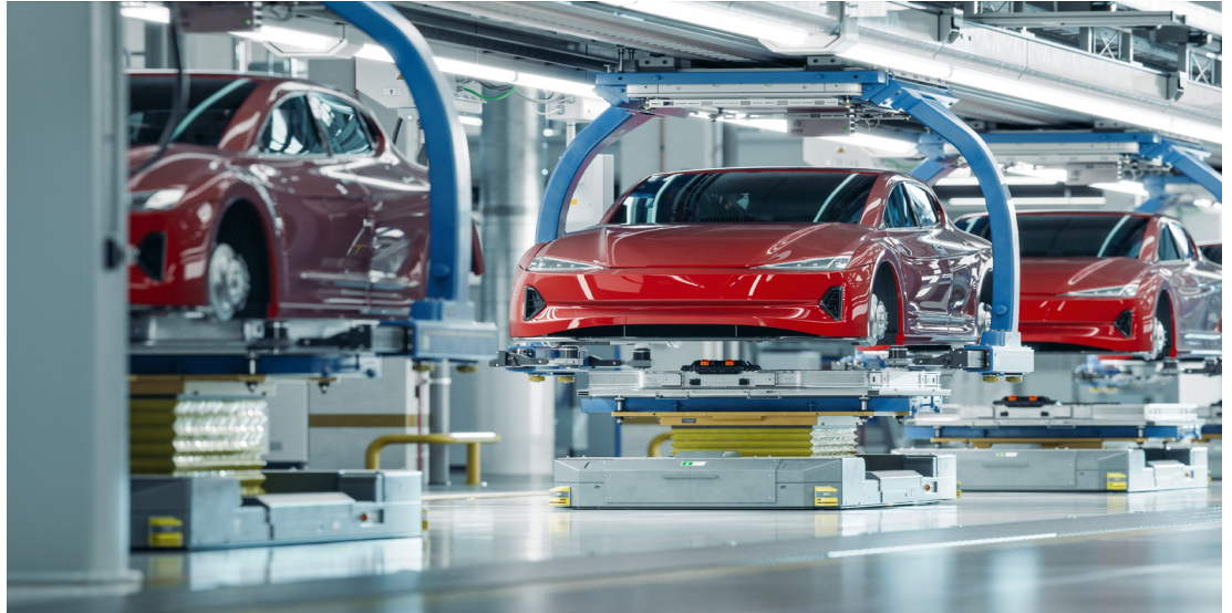
REBATES WILL BE OFFERED on automotive tariffs.

The administration’s goal is to bring automobile production jobs to the U.S., according to Scott Bessent, secretary of the treasury. What will be offered automakers that “finish their vehicles domes-