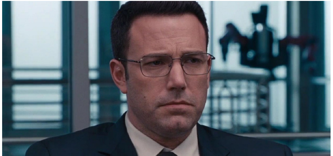
BEN AFFLECK returns in "The Accountant 2" (Amazon/MGM Studios).

The best scene in "The Accountant 2" might be when he exposes a human trafficking scheme at a pizza company by rapidly calculating a dubious gap of underreported pizza box expenses. (There, if ever, is a reason to