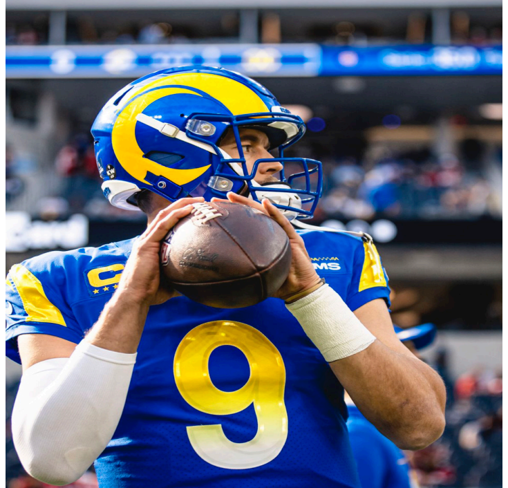
MATT STAFFORD has ironed-out the details for a new contract and looks forward to the fall (Rams photo).

The 37-year-old Stafford didn't go into many details about the standoff, which was much shorter this season after it stretched up to the start of training camp in 2024. The quarterback also acknowledged he did "due diligence" on potential landing spots in a trade before the Rams gave him what he wanted.