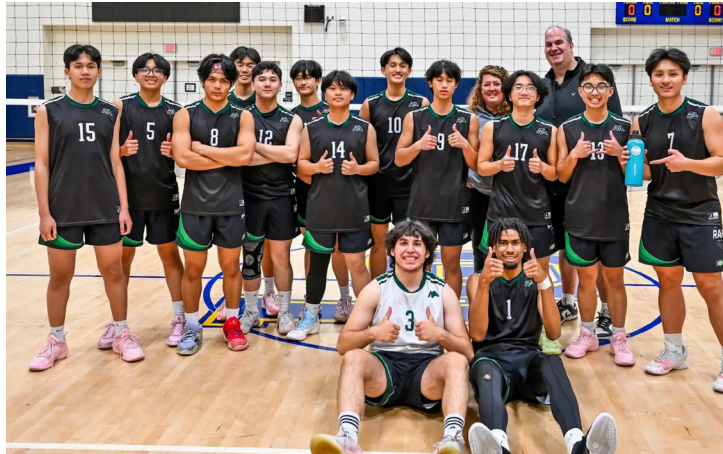
THE RANCHO ALAMITOS boys' volleyball team won the Garden Grove League title this year and advanced to the CIF-SS Division 5 playoffs this week..