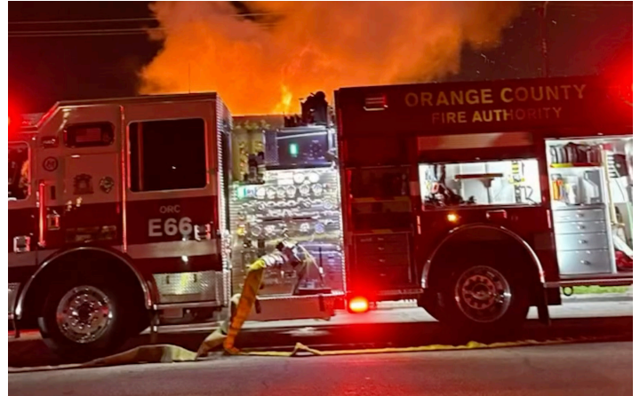
ENGINE 66 on the scene fighting a blaze on Moran Street in Westminster.

OCFA crews responded with a coordinated effort, attacking the