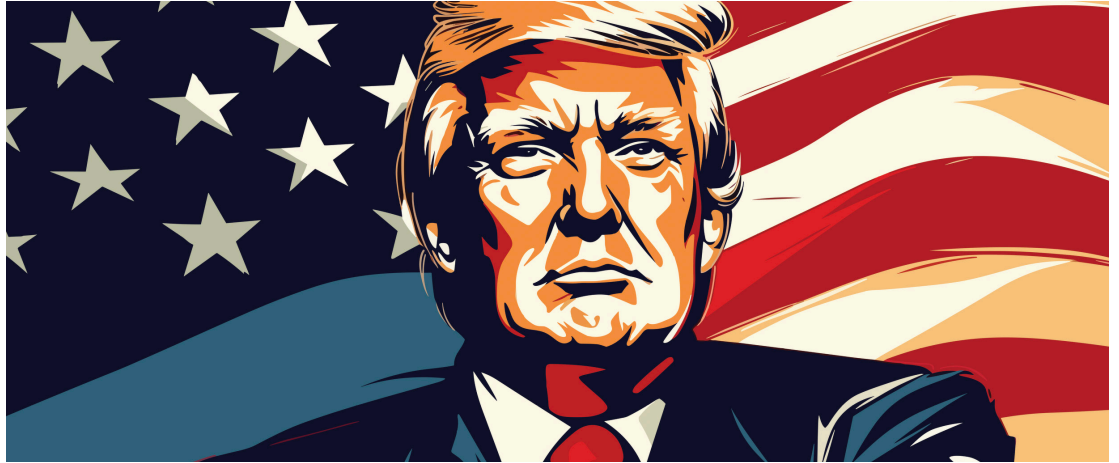
DONALD TRUMP backed a candidate for Wisconsin Supreme Court.

According to the Associated Press, Dane County Judge Susan Crawford defeated Waukesha County Judge Brad Schimel, allowing liberals to retain their