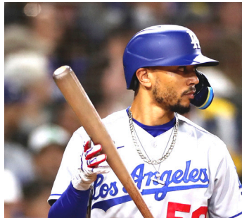
MOOKIE BETTS hit a two-run home for the Dodgers (File photo)

With each win, the Blue Crew extends its team-record start to 7-0. Against the Braves at Chavez Ravine, the Dodgers