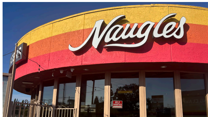
NAUGLES is back on Beach Boulevard in Stanton.

Damage in the first home was limited to less than half of the structure and the adjacent home was saved.