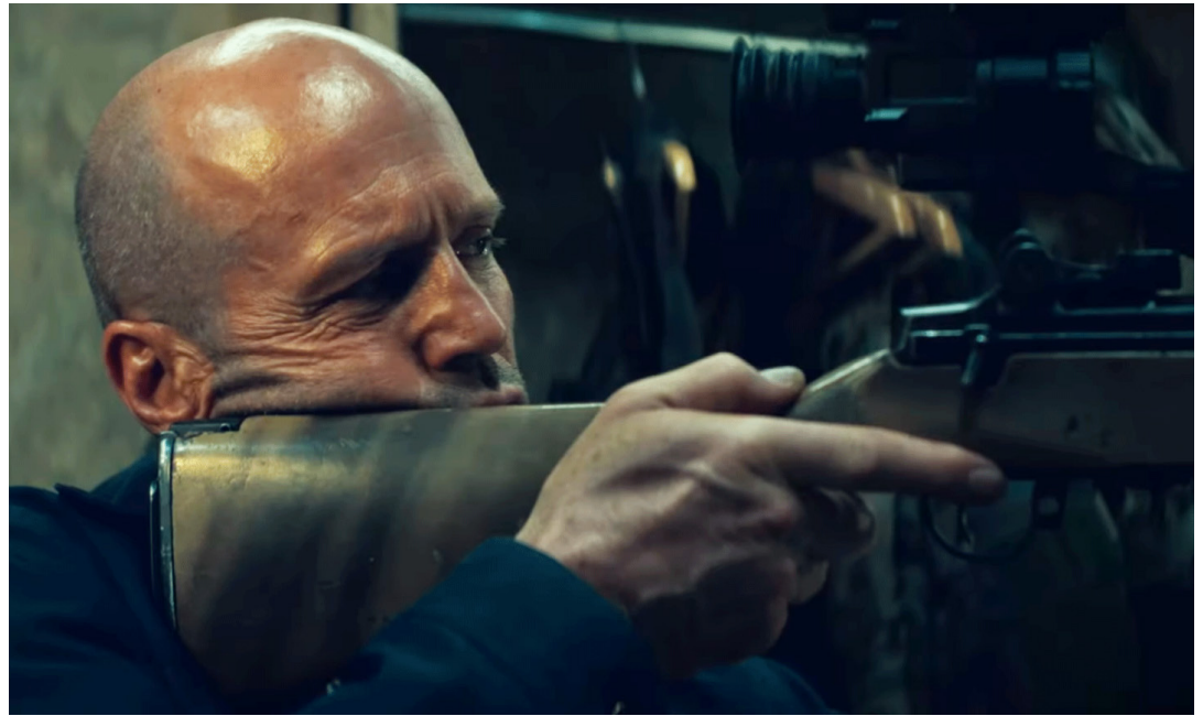
JASON STATHAM takes aim in “A Working Man”.

He’s a widower and a single father saving up money to fight — legally this time — for more custody by sleeping in his Ram truck. His in-laws want to limit his visitation, alleging he suffers from PTSD, a very cynical use by the movie-makers of a