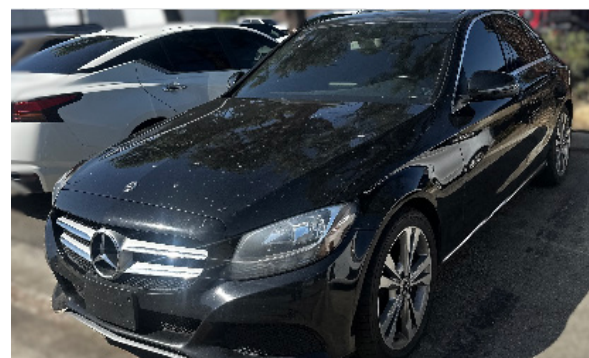
THE SUSPECT VEHICLE