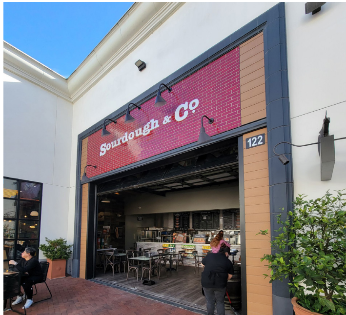
IN BELLA TERRA is HB’s Sourdough & Co..

I opted for the 6” French Dip and about two bites in, I definitely rued not going for the 8”. Simply put, this is one of the best French Dip sandwiches I have ever tasted. The warm sourdough bread is just perfect: slightly crunchy on the outside (but not “tear-the-roof-of-your-mouth” crunchy) and soft and pillowy on the inside. It holds together the tender, thinly sliced roast beef, slightly tangy