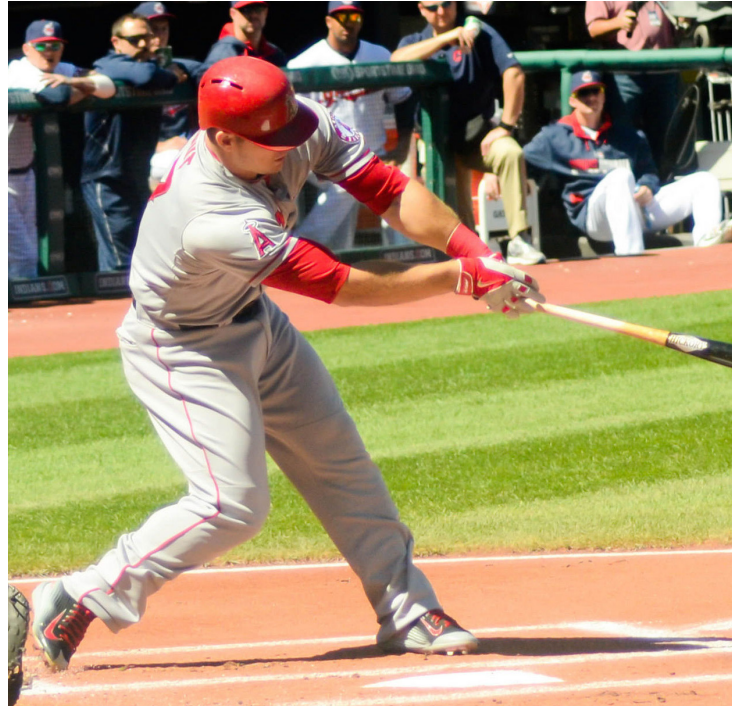
MIKE TROUT has been injury-plagued in recent seasons but is hopeful about an early return to the lineup. Nothing is yet certain, he cautions.

30, when he left the game against the Mariners with knee soreness eventually diagnosed as a bone bruise. He had two operations last year on the knee after tearing his meniscus.