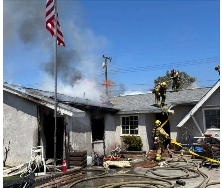
SMOKE SHOWING from a home in the 10300 block of Hickcock Road in Stanton on Friday.

Damage to the structure is estimated at $500,000 and $150,000 to contents. The cause of the fire is under investigation.