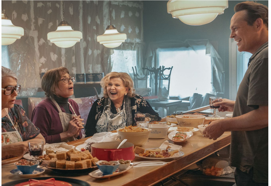
LORRAINE BRACCO, Talia Shire, Brenda Vaccaro and Vince Vaughn in a scene from "Nonna" (Netflix).