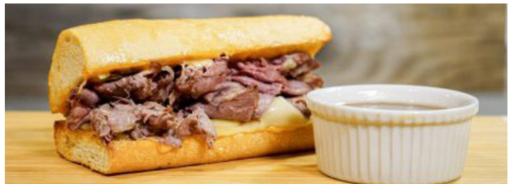
CLASSIC FRENCH DIP at Sourdough & Co..

Such was the case with Sourdough & Co. in Huntington Beach. A co-worker and I were recently looking for a lunch spot