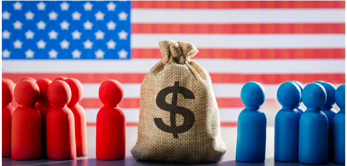
THE PROPOSED FEDERAL BUDGET for 2025-26 is on its way.

About $5 trillion in tax cuts are in the bill, including ending taxes on tips, overtime and interest on automobile loans. Possible changes will include greater deductions for state and local taxes paid. Democrats have vowed to oppose the bill, but Republicans hold narrow majorities in both the