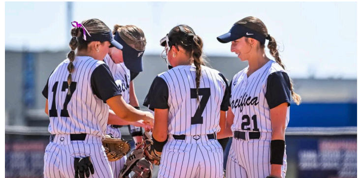
PACIFICA WILL face a familiar opponent on Thursday in El Modena in the CIF-SS softball playoffs.

In Division 1, Huntington Beach (21-7) will visit an unbeaten Charter Oak (16-0) team on Thursday. That same day, Pacifica (15-11) will visit El Modena (18-8), a clash of two teams that tied for the Crestview