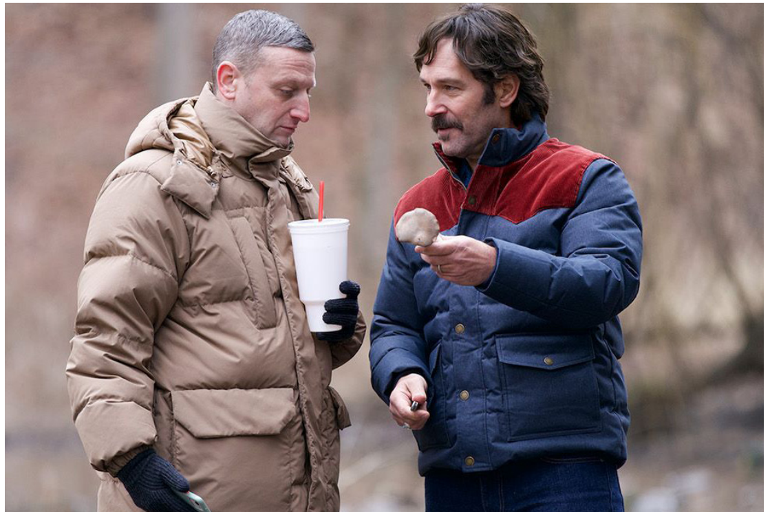
PAUL RUDD and Tim Robinson in the "Friendship" about men's relationships (A24 release).

Craig soon comes under Austin's spell — the pair smoking, going on an adventure to an