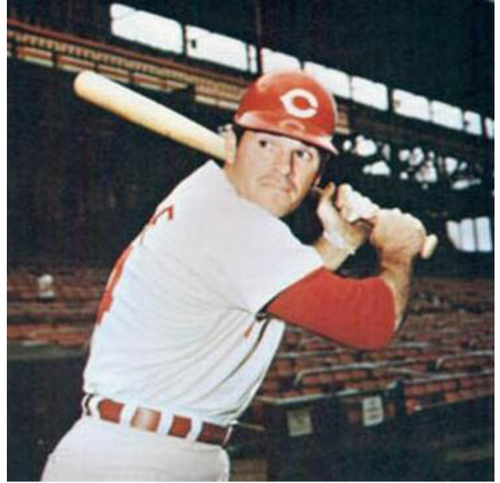
PETE ROSE in a 1972 photo on a baseball card. He was with the Cincinnati Reds then, where he spent most of his major league baseball career.

ity is even more important – and more tightly policed – than ever. Gambling on baseball is still as taboo as it was in 1919.