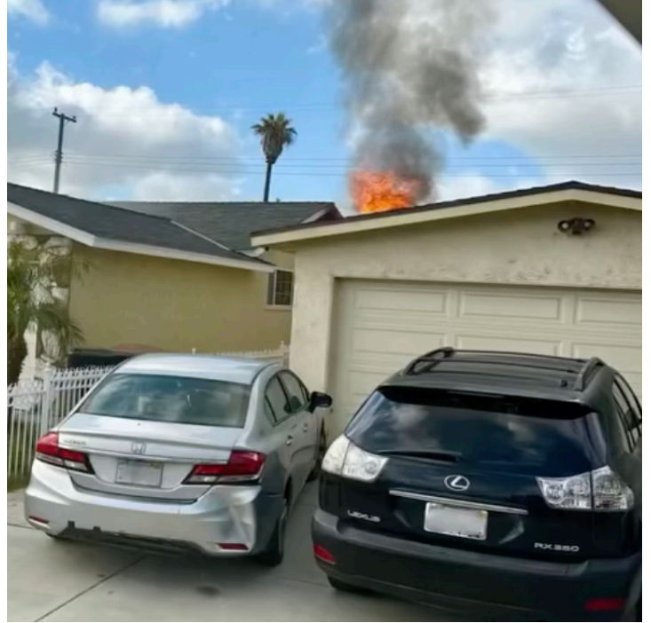
FLAMES SHOWING from a home in on Schooner Driver in south Garden Grove on Wednesday.

Assisting the OCFA were the Garden Grove Police Department, Fountain Valley Fire Department and SoCal Red Cross.