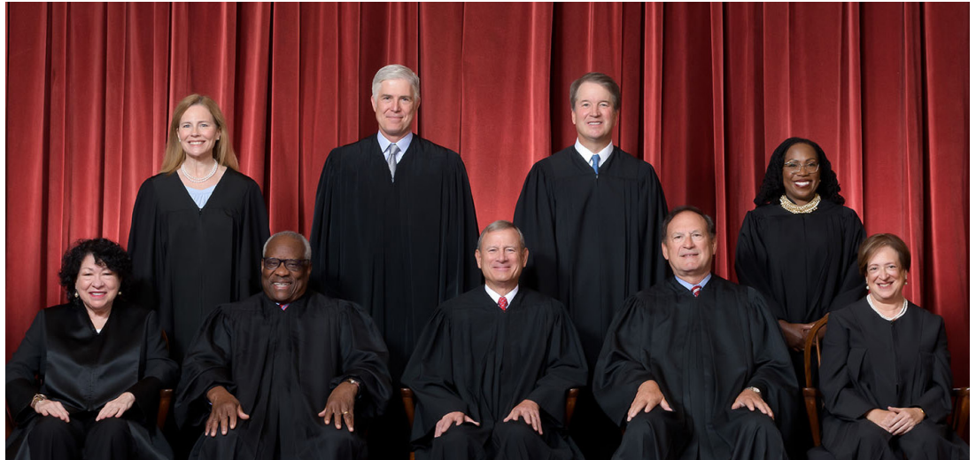
U.S. SUPREME COURT rejected deportation of Venezuelans.

President Donald Trump expressed his displeasure in a social