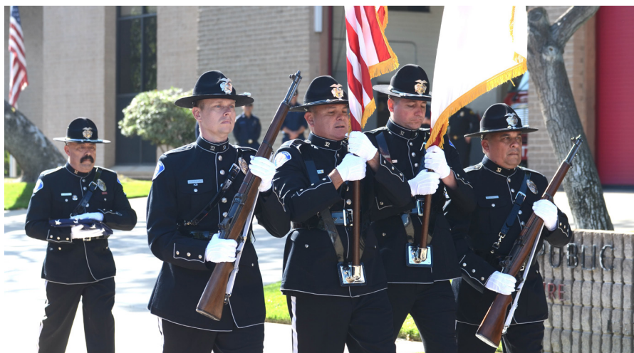
GARDEN GROVE police honor guard at Thursday's "Call to Duty" event paying tribute to GGPD officers who lost their lives in the line of duty.