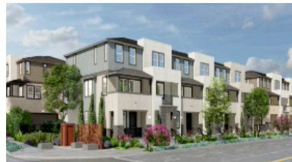
ARTISTS' RENDERING (City of Westminster)