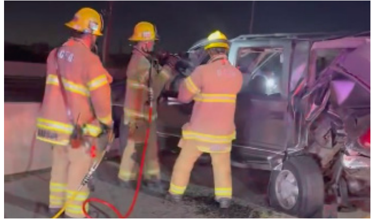
FIREFIGHTERS use the “Jaws of Life” to rescue an victim from a vehicle crash on the Garden Grove Freeway.

Three persons – of which one was trapped – were in one vehicle and a fourth was undergoing CPR treatment by California