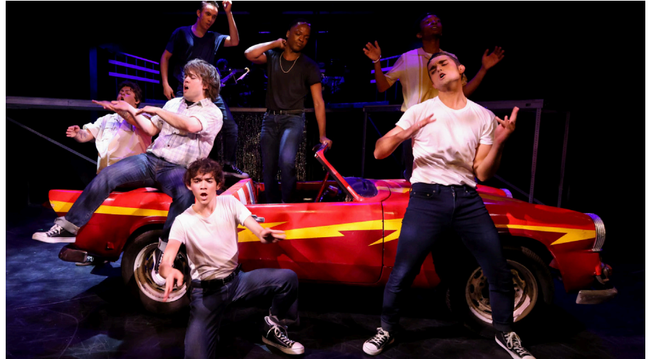
THE POPULAR musical "Grease" about the "good old days" of the 1950s is still on stage at Garden Grove's Gem Theatre on Main Street through July 20..