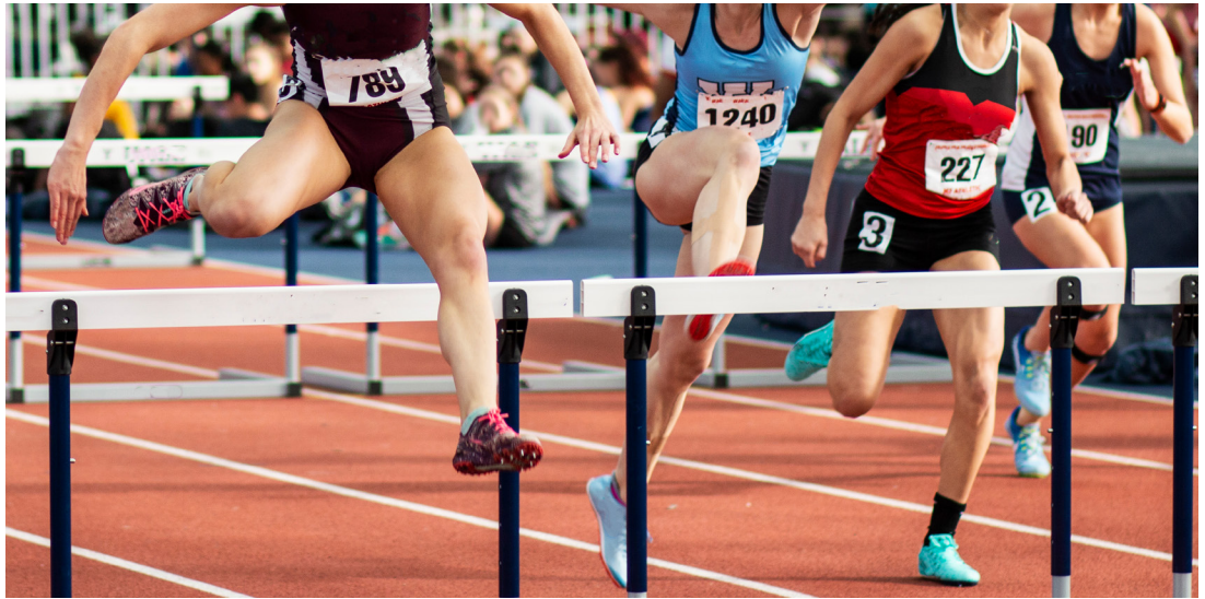
SHOULD TRANS girls compete against other girls in high school athletics