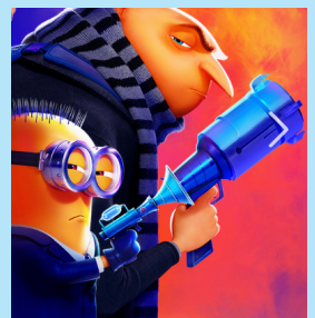
'DESPICABLE ME 4'

Still ahead on the schedule are free showings of "Kung Fu Panda 4" on July 35 and "Inside Out 2" on Aug. 1.