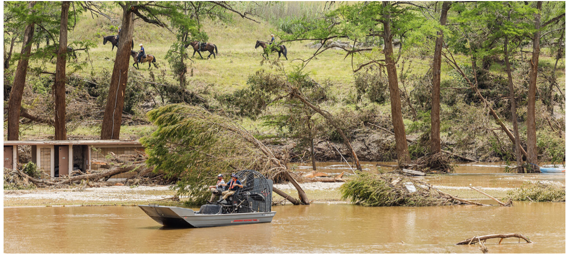
SEARCH AND RESCUE along the Guadalupe River in Texas

A local news reporter asked about allegations that warnings about flash flooding were not issued soon enough. "Only a bad person would ask a question like that," replied the president.