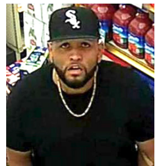
SUSPECT SOUGHT.

He is described as a male Hispanic about 25-35 years old with brown eyes and a black beard. He had a medium build and