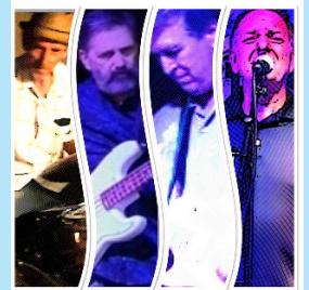
TONE BROS. BAND

They play acoustic blues and classic rock and it's all for free.