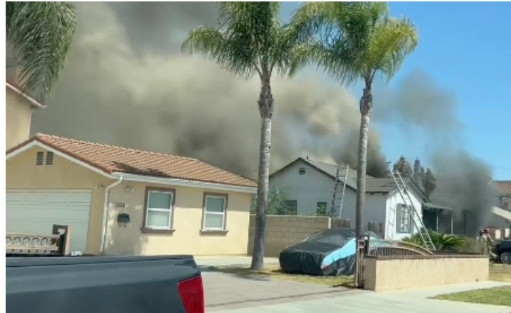
HOUSE FIRE on Monroe Street in Garden Grove (above). Photo below shows damage to out-building.