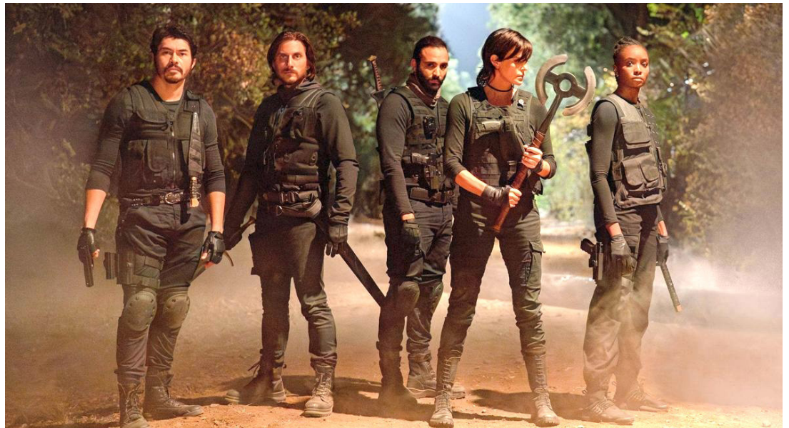
HENRY Golding, Luca Marinelli, Marwan Kenzari, Charlize Theron and KiKi Layne in a scene from "The Old Guard 2." (Netflix)