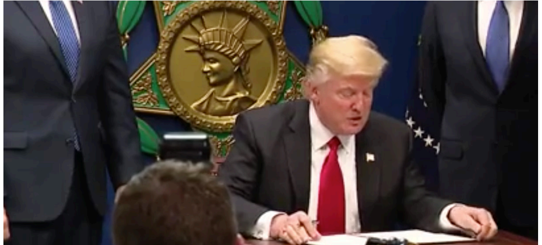
PRESIDENT DONALD TRUMP signed the “Big Beautiful Budget Bill”

According to the Associated Press the bill includes $4.5 trillion in tax cuts and adds temporary new tax deductions on tips, overtime wages and automobile loans.