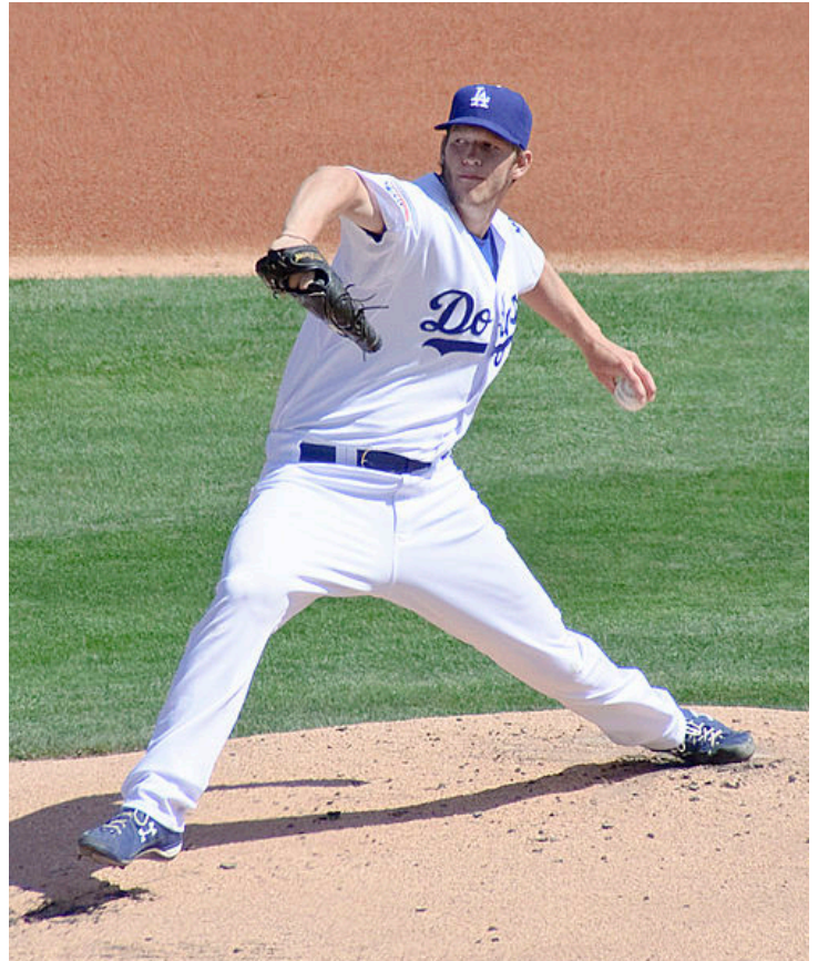
CLAYTON KERSHAW struck out his 3,000th batter on Thursday in a Dodger victory

"I made it interesting. Made it take too long," Kershaw said. "Honestly, I didn't pitch that great tonight. The slider was so bad."