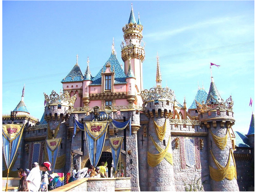
SLEEPING BEAUTY'S CASTLE is perhaps the most iconic sight in Disneyland, which opened 70 years ago this week (File photo).