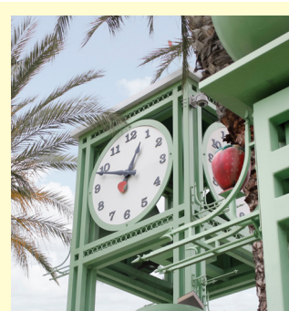
CLOCK TOWER IN VILLAGE GREEN

The Santa Ana River these days – most of the time – is a bone-dry flood control channel. But it wasn't always that way and it wasn't always on its current course. The massive flooding of the early 1860s is believed to have altered its path a bit and created "tributaries" that resembled little rivers of their own. One of those streams split off and crossed what