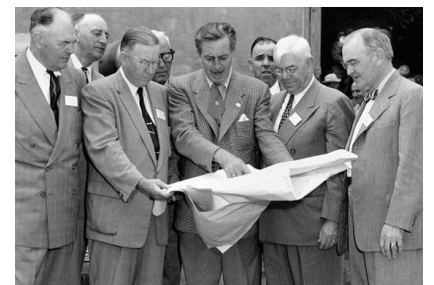
IN 1954 , Walt Disney and plans.

The park's emphasis on storytelling and attention to detail is still evident today in theme parks across the world. Disneyland now ranks as the world's second-most visited theme park, closely behind Magic Kingdom at Dis-