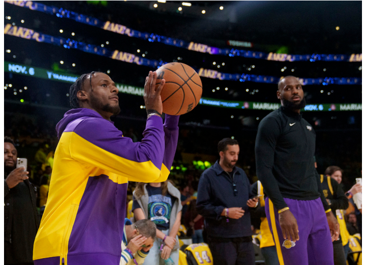
LOS ANGELES Lakers guard Bronny James, left, and forward LeBron James warm up before an NBA basketball game against the Minnesota Timberwolves, Oct. 22, 2024, in Los Angeles.

Bronny sounds ready to spend a long, hot summer ducking rumors, pleading ignorance on innuendo and concentrating on the work necessary to become a contributor during his second NBA season with the Lakers.