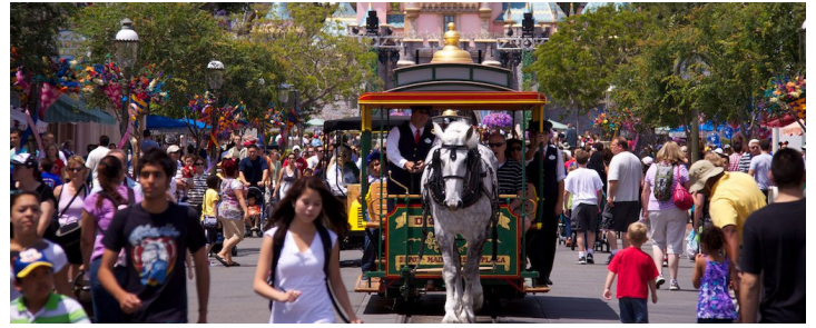
MAIN STREET in Disneyland (File photo).