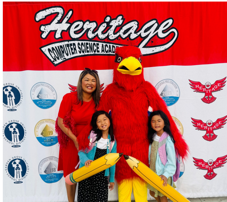
HERITAGE COMPUTER SCIENCE ACADEMY in Garden Grove was one of many area schools having colorful back-to-school observances last week.