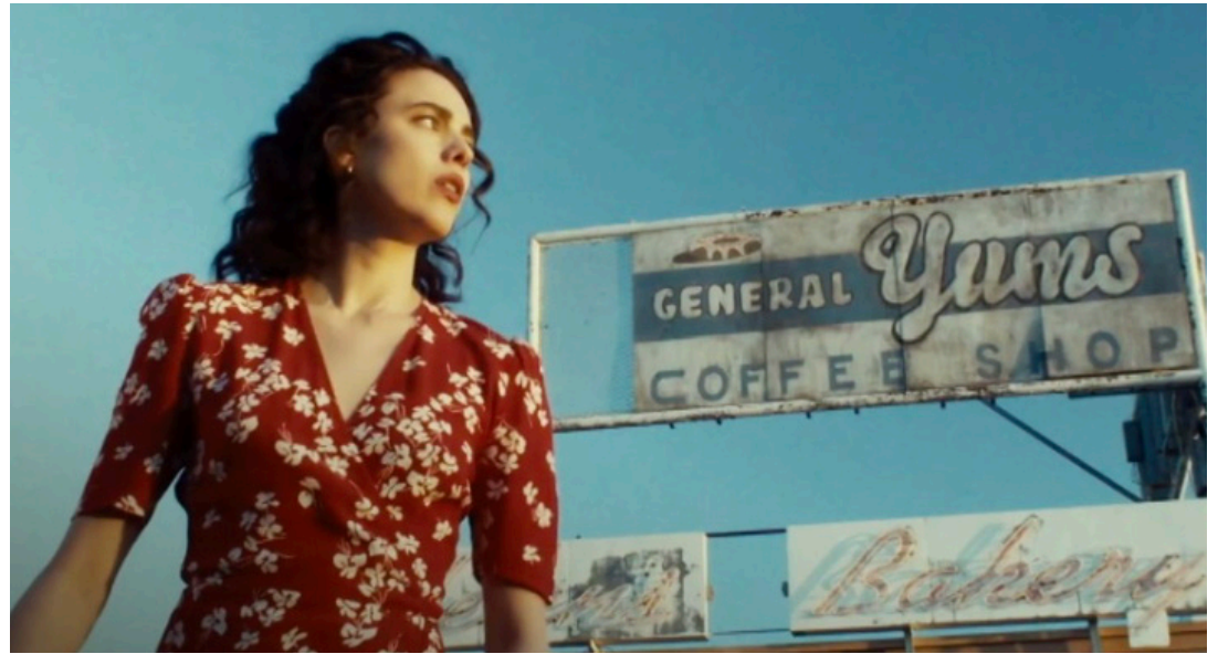
MARGARET QUALLEY stars as a private eye in "Honey, Don't" (Focus Features).

Not only is queer literacy low in this Bakersfield, but many in town seem to have come under the influence of a church leader played by Chris Evans, the Rev. Drew Devlin, whose high-