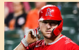
SPORTS PAGES 6-7