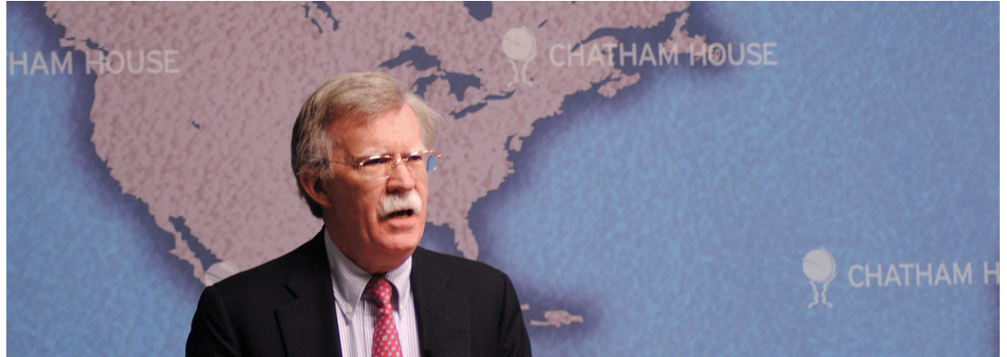
JOHN BOLTON, formerly national security adviser (Wikipedia).

by two federal judges Bolton could be accused also removing the material from government offices, both of them a federal offense. Sources suggest that