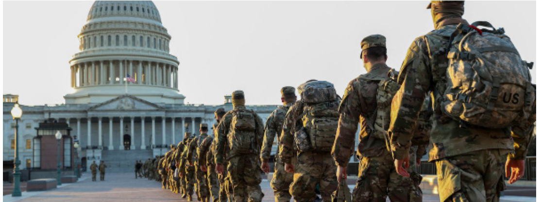
NATIONAL GUARD soldiers in Washington D.C.

think about the circumstances – right now – we have more police, and we want to make sure we use them," she said.