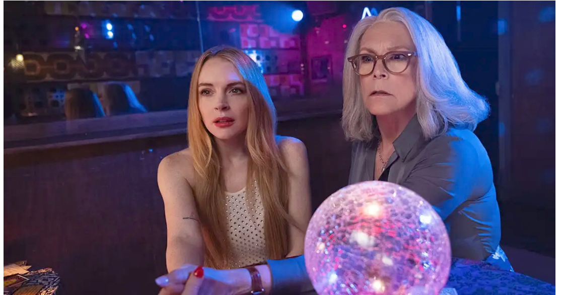
JAMIE LEE CURTIS and Lindsay Lohan in "Freakier Friday" (Walt Disney Pictures).

Then there's the double body-swapping. Because one major swap isn't enough, here we have two sets of swappers — a quixotic quartet of lives disrupted during the lead-up to, yes, another wedding! The problem is that sometimes, it's actually hard to keep track of who's inhabiting whom, and therefore why they're doing what. Not to say that "Freakier Fri-