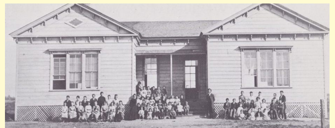
WESTMINSTER'S FIRST SCHOOL Around 1890s. Community founded in 1870.

Westminster doesn’t have what might be called a typical “downtown,” but it once did. What’s now Sigler Park (at 7200 Plaza St, at Olive Street) first served as the city’s original central business district, but was bypassed with the arrival of (Huntington) Beach Boulevard — also known as Highway 39 — in the 1920s, creating the “New Westminster” at Beach and Westminster Avenue (now Boulevard), which is home to the Civic Center.