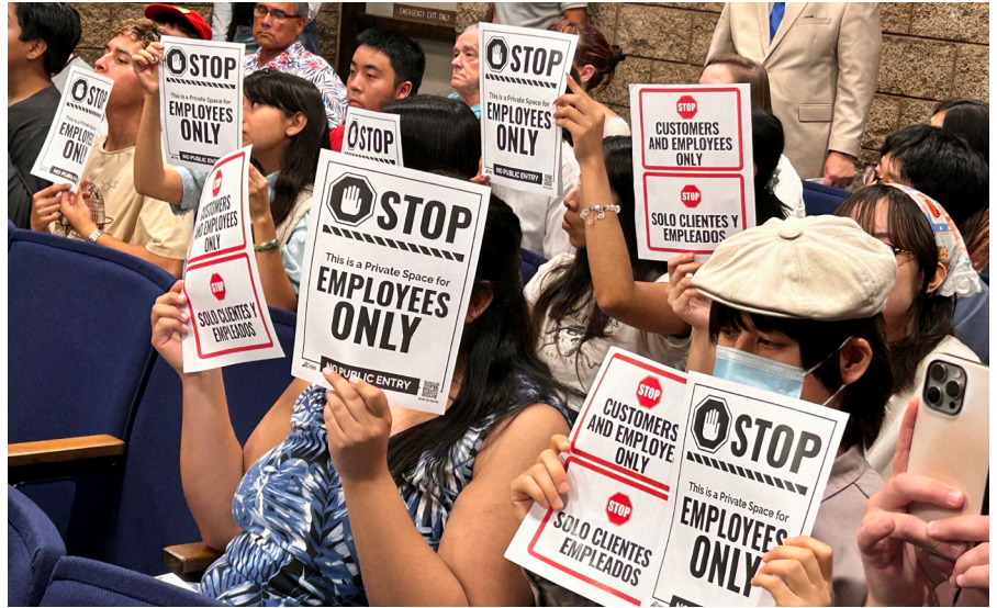
SUPPORTERS of a "Harmony and Safety" resolution at Tuesday's Garden Grove City Council meeting display signs.

The near-capacity crowd in the council chamber overwhelmingly backed the resolution authored by Arestegui and some dis-