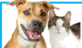
DOGS AND CATS AGREE: