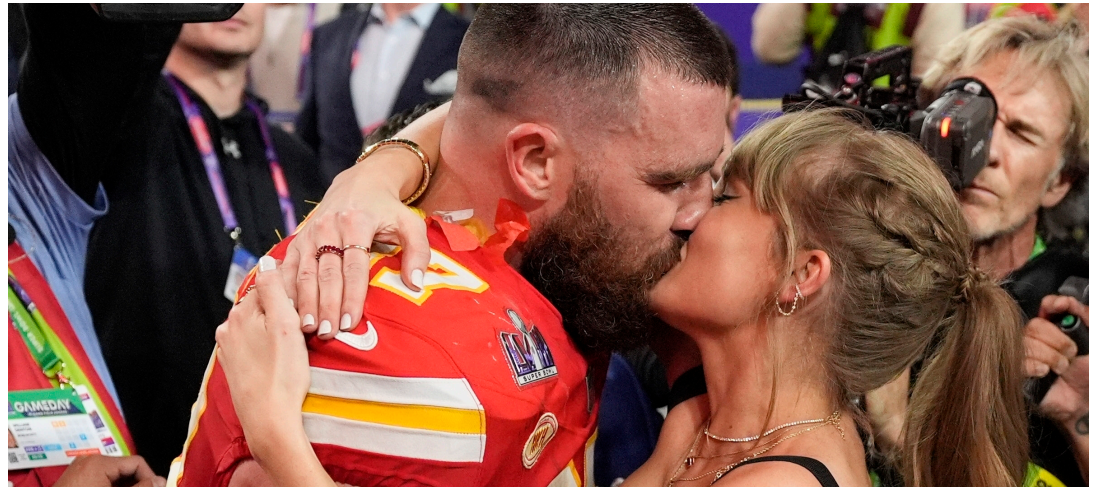
KANSAS CITY Chiefs tight end Travis Kelce (87) kisses Taylor Swift after the NFL Super Bowl 58 football game against the San Francisco 49ers, Sunday, Feb. 11, 2024, in Las Vegas. The Chiefs won 25-22.

No date has been revealed for the nuptials, and coverage of all the events preceding the proces-