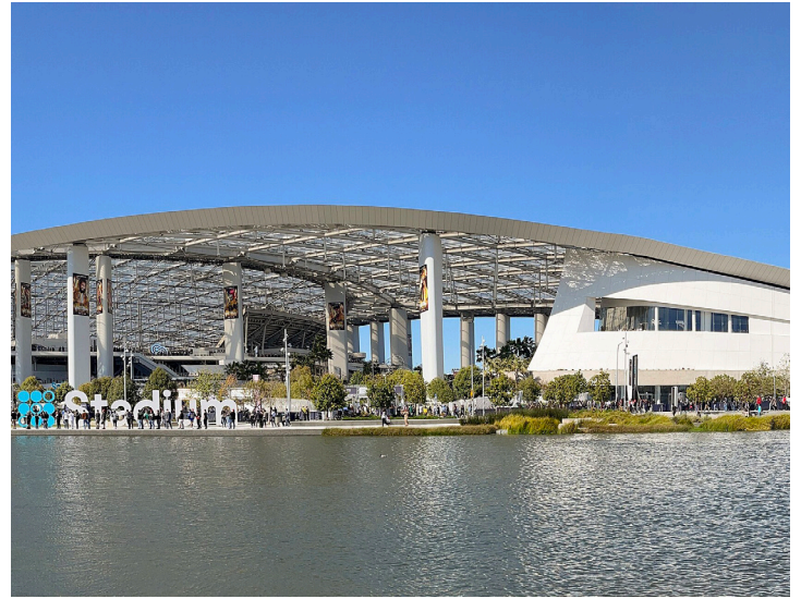
SOFI STADIUM in Inglewood.

Five rankings for West OC teams next week.