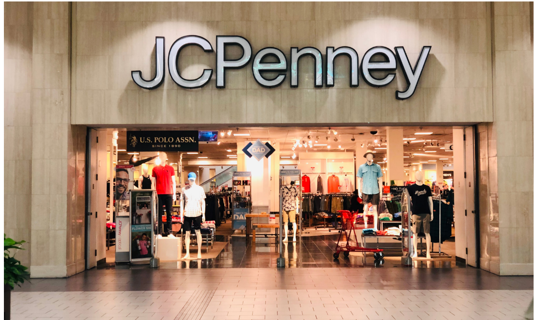
THE JC PENNEY department store in Westminster Mall will be closed in November, affecting 76 employees. After the closure the remaining OC stores will be in Santa Ana and Orange.