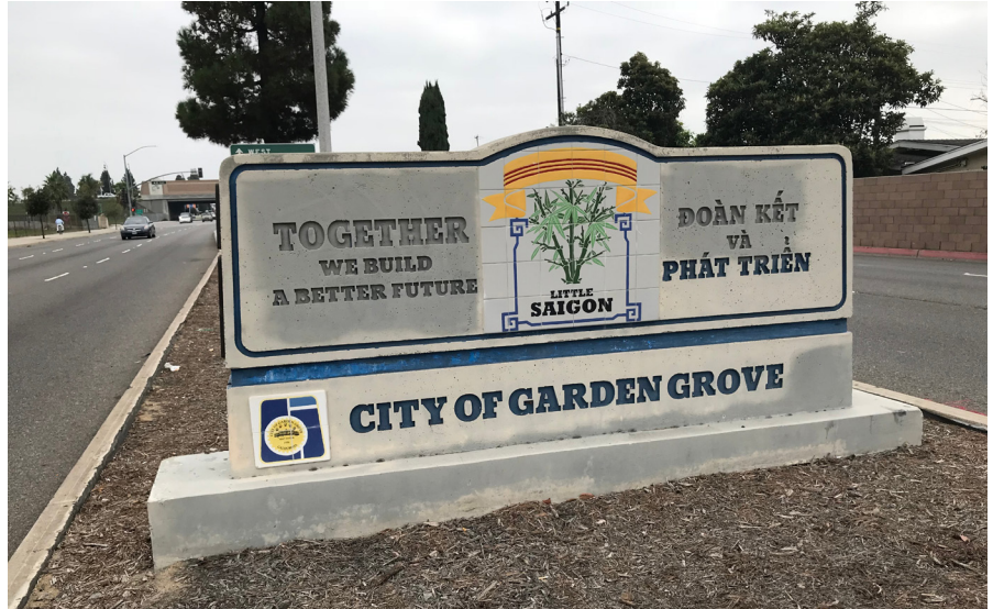
SIGN ON BROOKHURST STREET south of Trask Avenue in Garden Grove referring to the Little Saigon area in the southern part of the city.