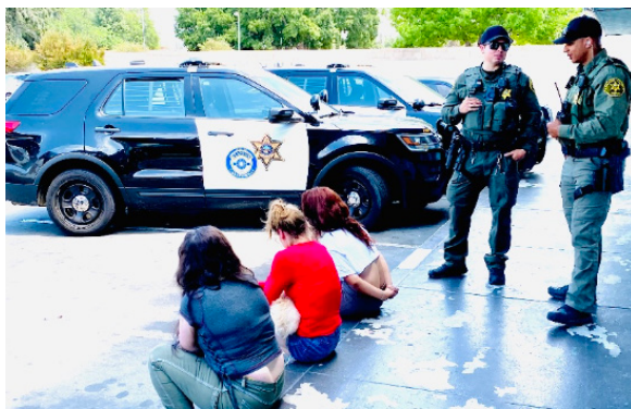
SHERIFF’S DEPUTIES serve Stanton

Such security guards would be employed to patrol city parks, facilities, streets and rights-of-way.