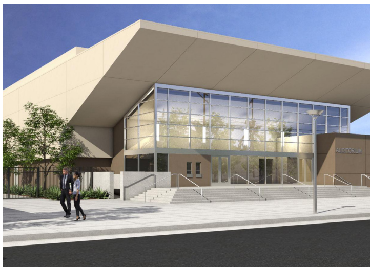
THE AUDITORIUM at La Quinta High School in Westminster.