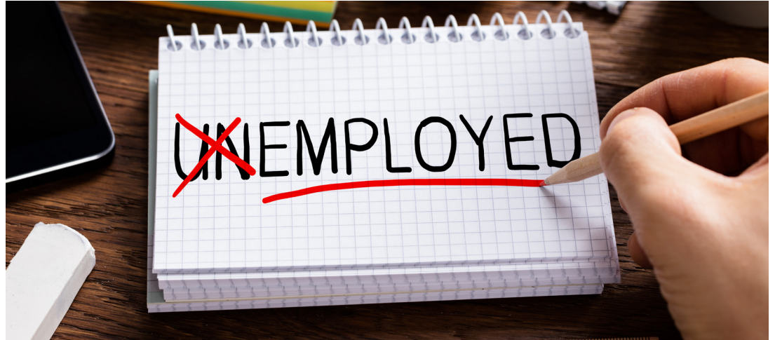
22,000 JOBS were added in the U.S. in August, considered a modest increase. The unemployment rate rose from 4.1 percent to 4.3 percent.

Economists told The Times that tariffs put in place by the president have driven up costs for